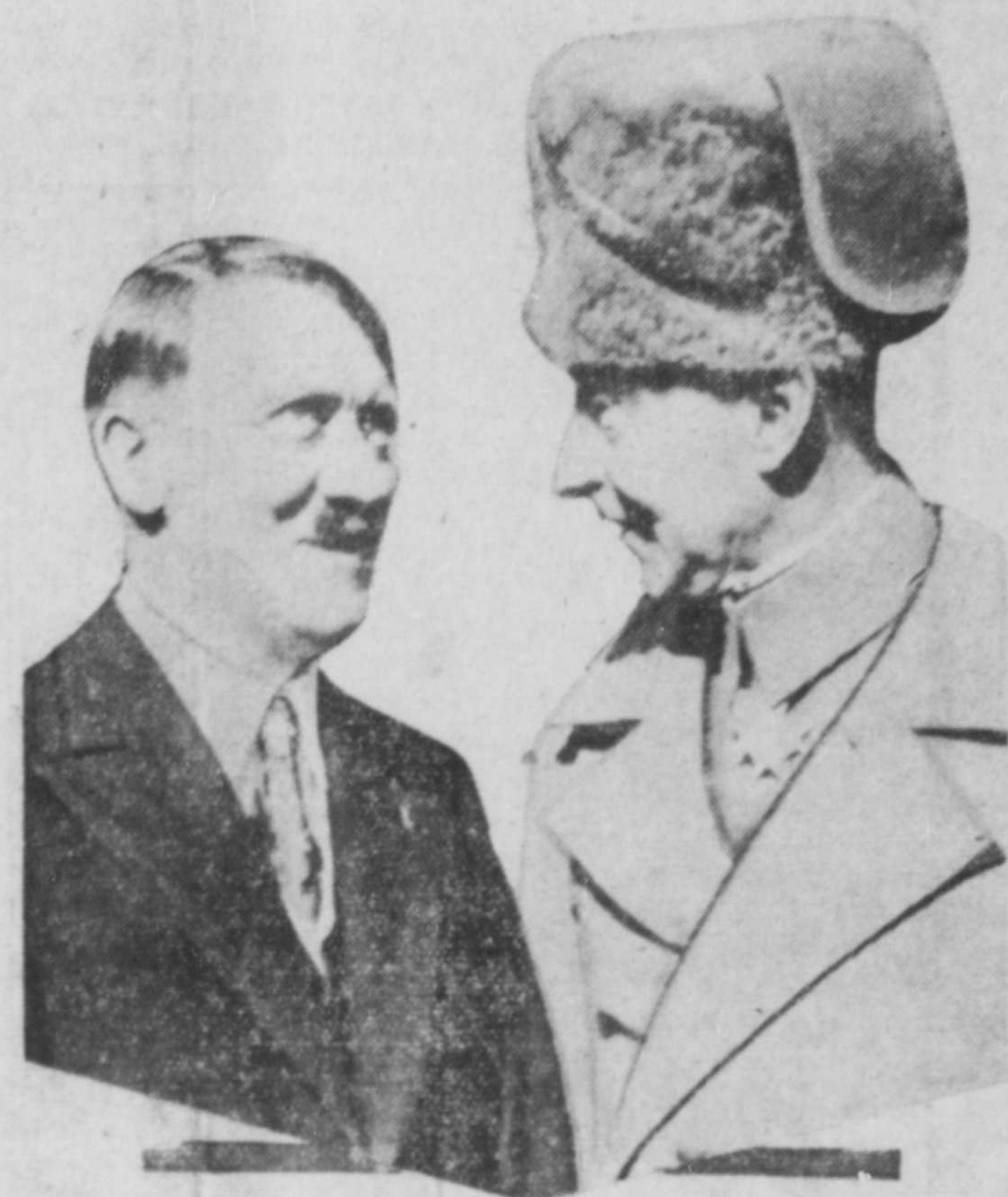
Adolf Hitler (left) chats with former Crown Prince Wilhelm of Germany just before the re-opening of the Reichstag in the garrison church at Potsdam. At that session Hitler demanded, and obtained, full dictatorial powers in Germany for four years.