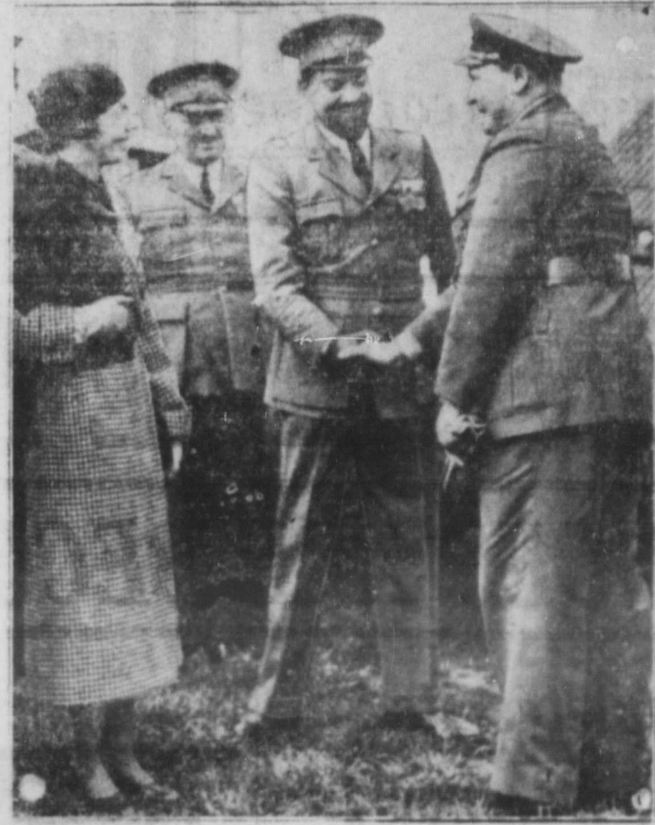
Italo Balbo, Italian minister for aviation (with beard) welcomes Captain Hermann Wilhelm Goering, German minister without portfolio and chief aide of Chancellor Hitler, as the latter arrives in Rome by aeroplane, to discuss Italo-German relations with Premier Mussolini. A simultaneous German visitor to the Italian capital was vice-chancellor von Papen.