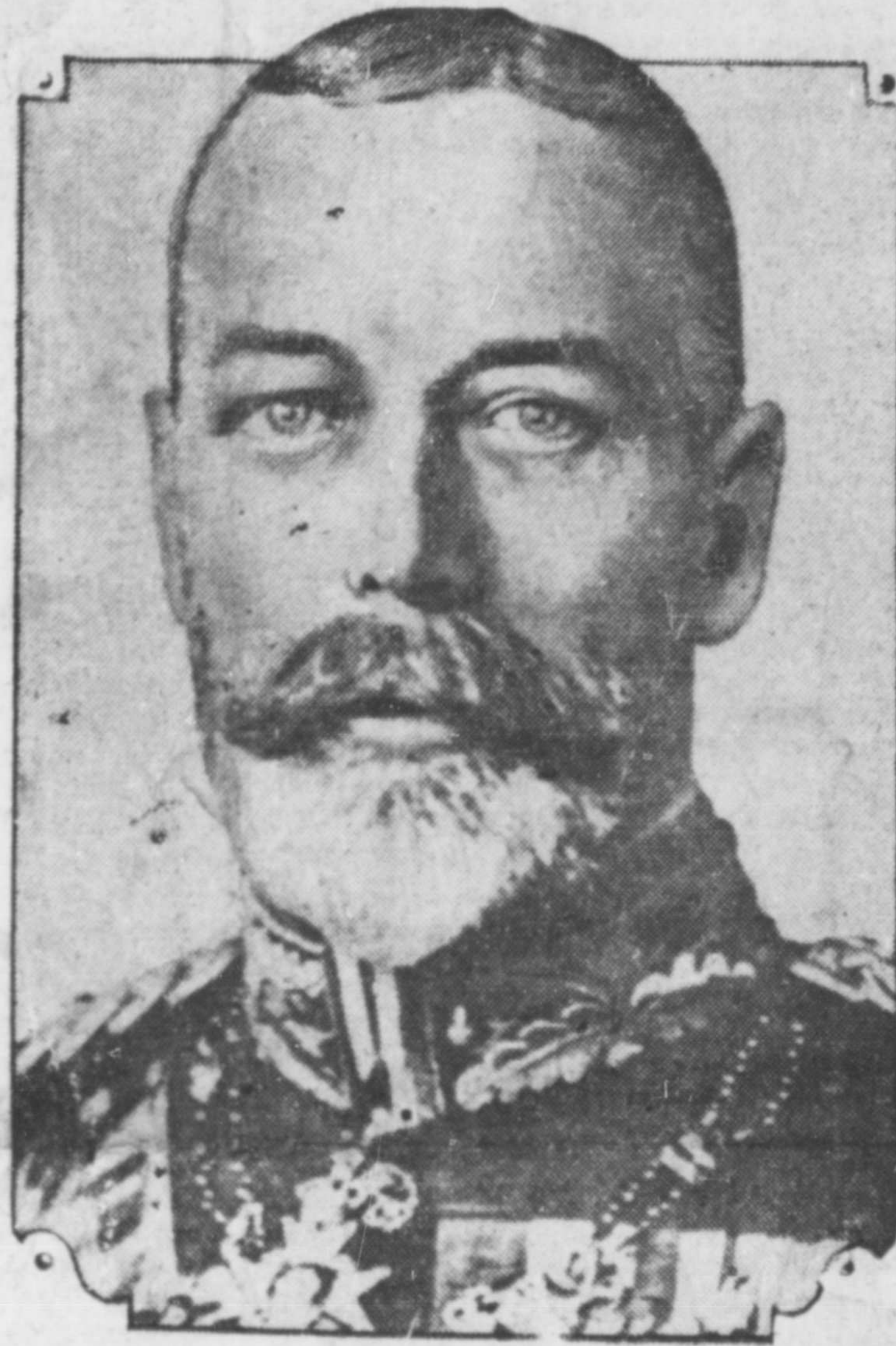
King George V. who again delivered Christmas Day message to people of Empire over radio network.