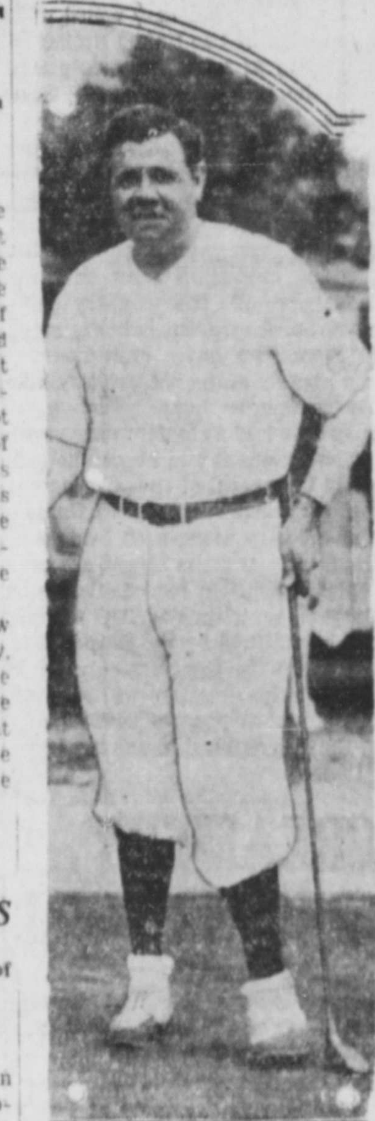
Babe Ruth, home run king of the New York Yankees, who refuses to accept $50,000 contract, which has been offered him for the present year by Colonel Ruppert.