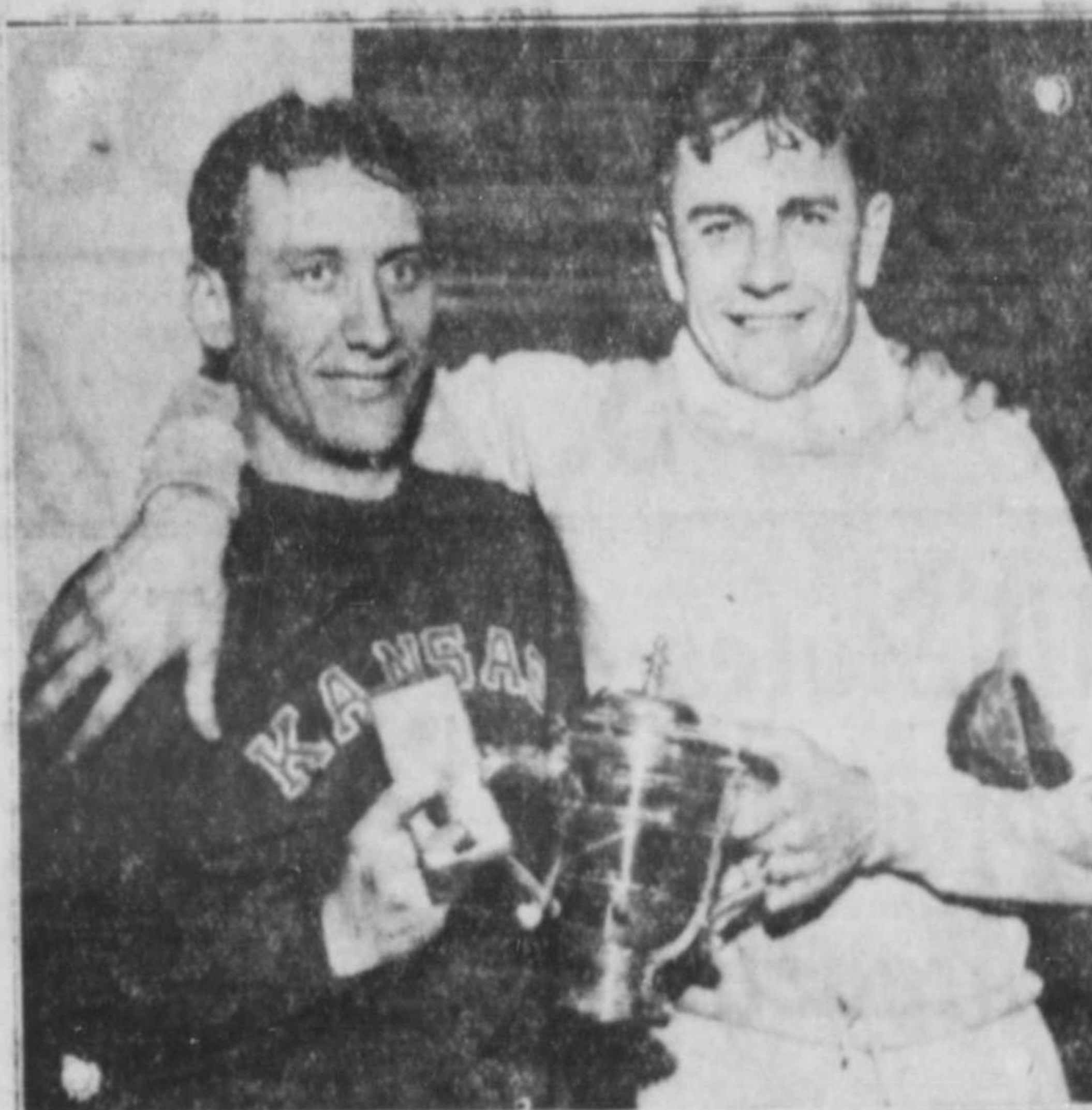
TRACK VICTOR AND VICTORIOUS RIVAL