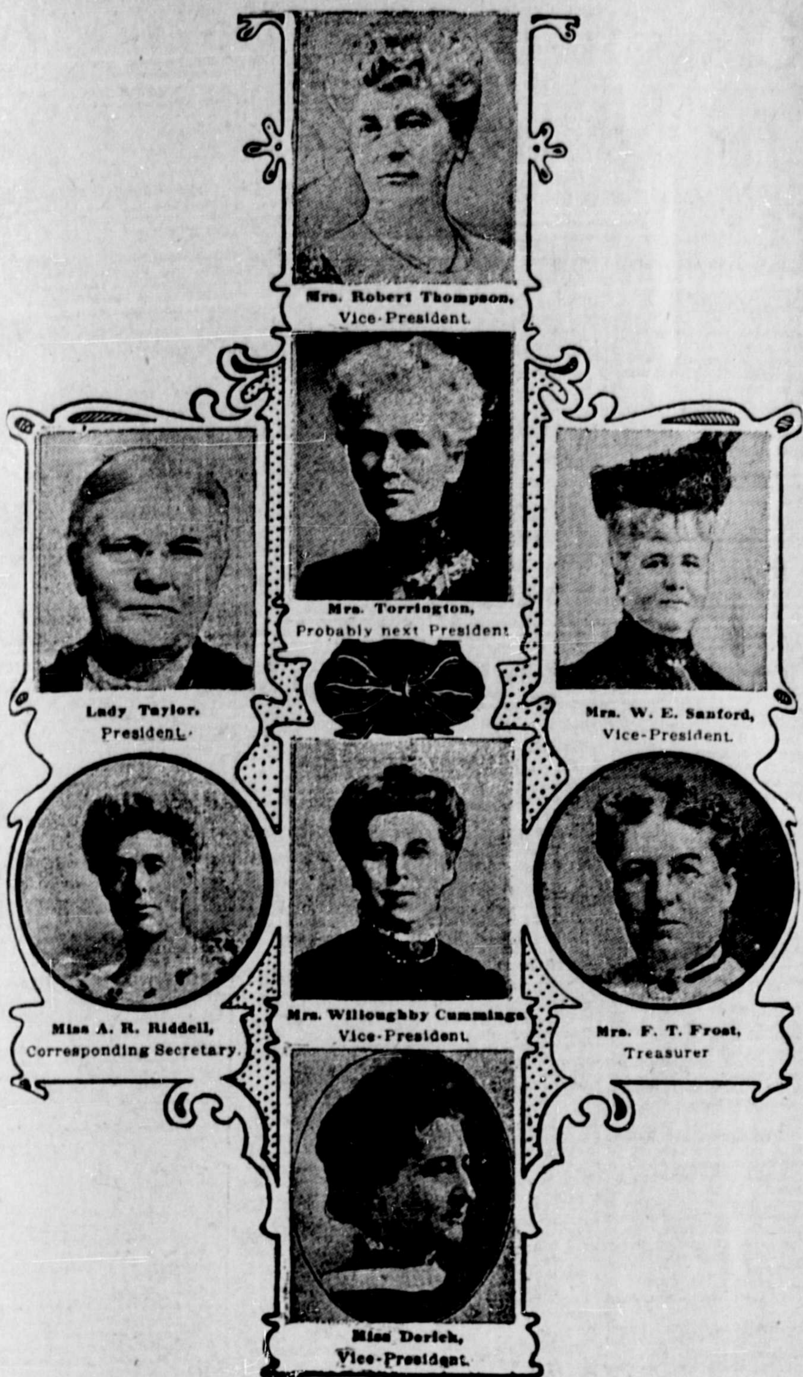
Several of the Moving Spirits at the Recent Convention at Port Arthur