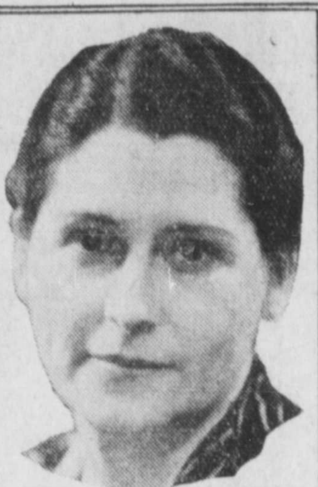
"We tried Nestlé's Evaporated Milk at our summer camp first . . . now we use it regularly at home in preference to any other brand. It is so handy and convenient . . . I use it now in any recipe that calls for milk . . . the results are so much better and the cost is so low."

The recipe given opposite is one that will be sure to find a place in your "special recipe" book. Try it—and then clip it out for further use.