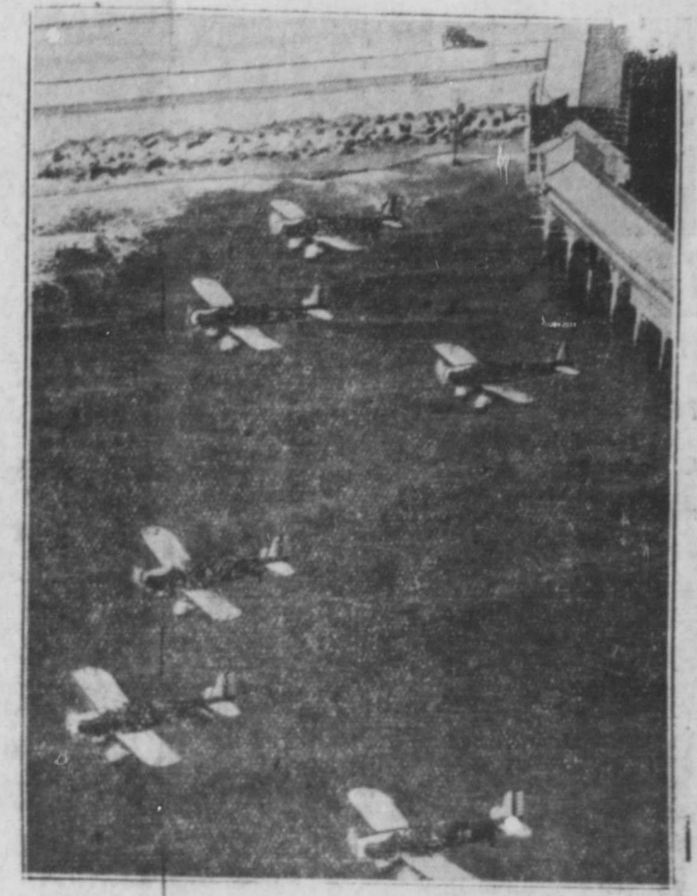
Six of the new Curtiss YA-8 attack aeroplanes of the United States army air corps third attack group, are shown in formation off the Galveston, Texas, seaway, while carrying out their training program