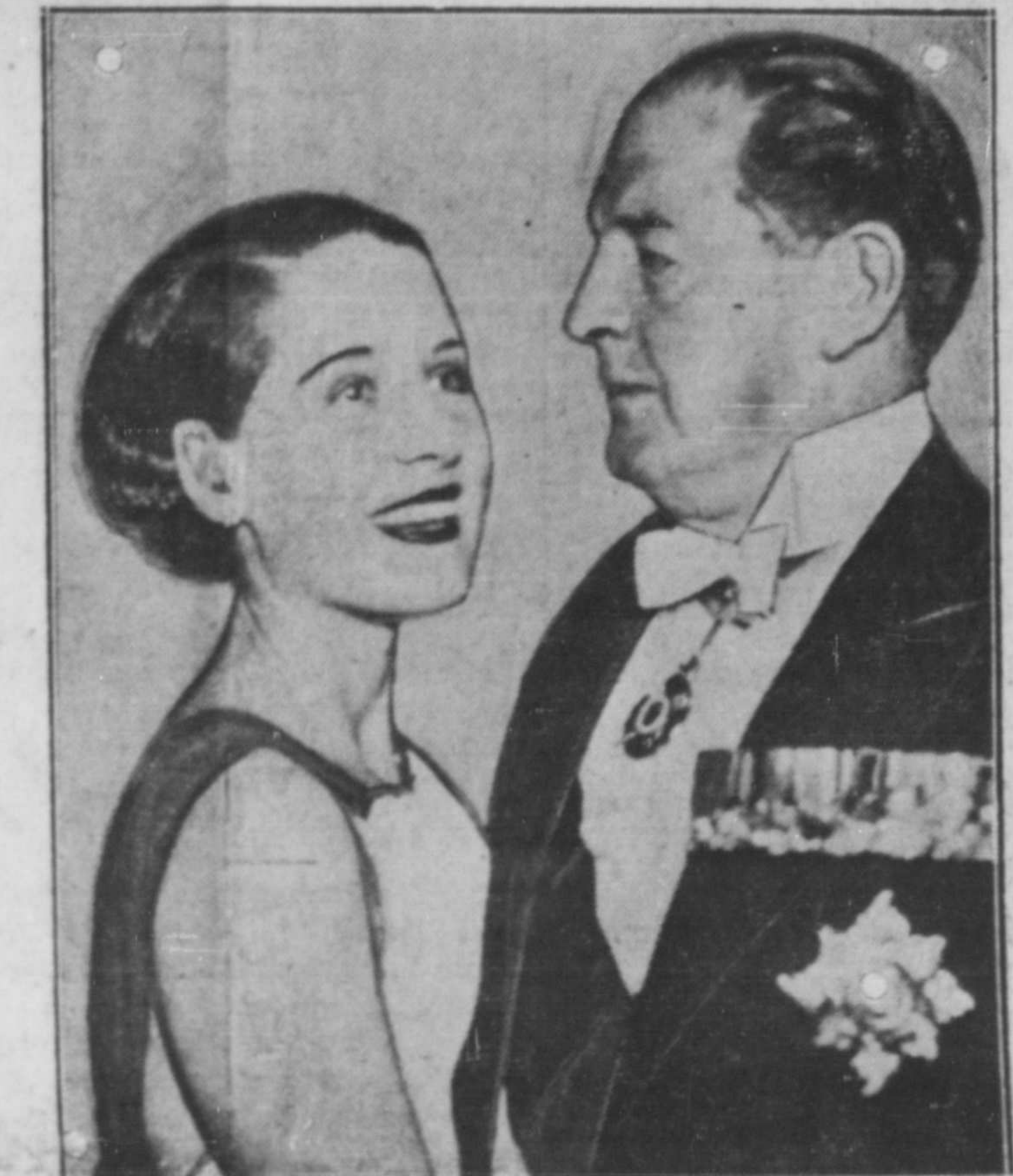
If the admiral was "all at sea" would you blame him? Admiral Earl Beatty, commander of the first squadron of Jutland, dances with Norma Shearer, Canadian-born screen star, at a London charity ball