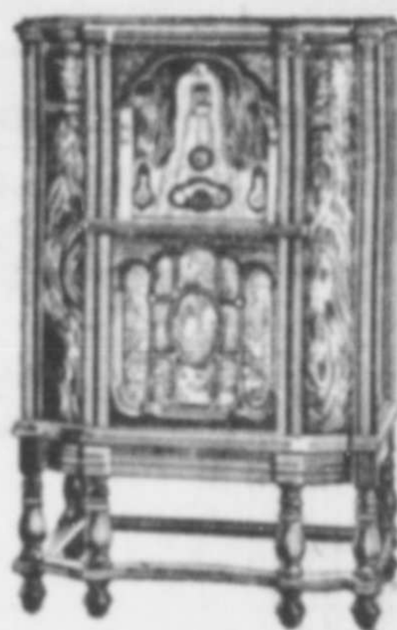
The 280 $199.00 Easy Terms

PERFORMANCE with TONA-LITE Control The New High Peak of Perfection