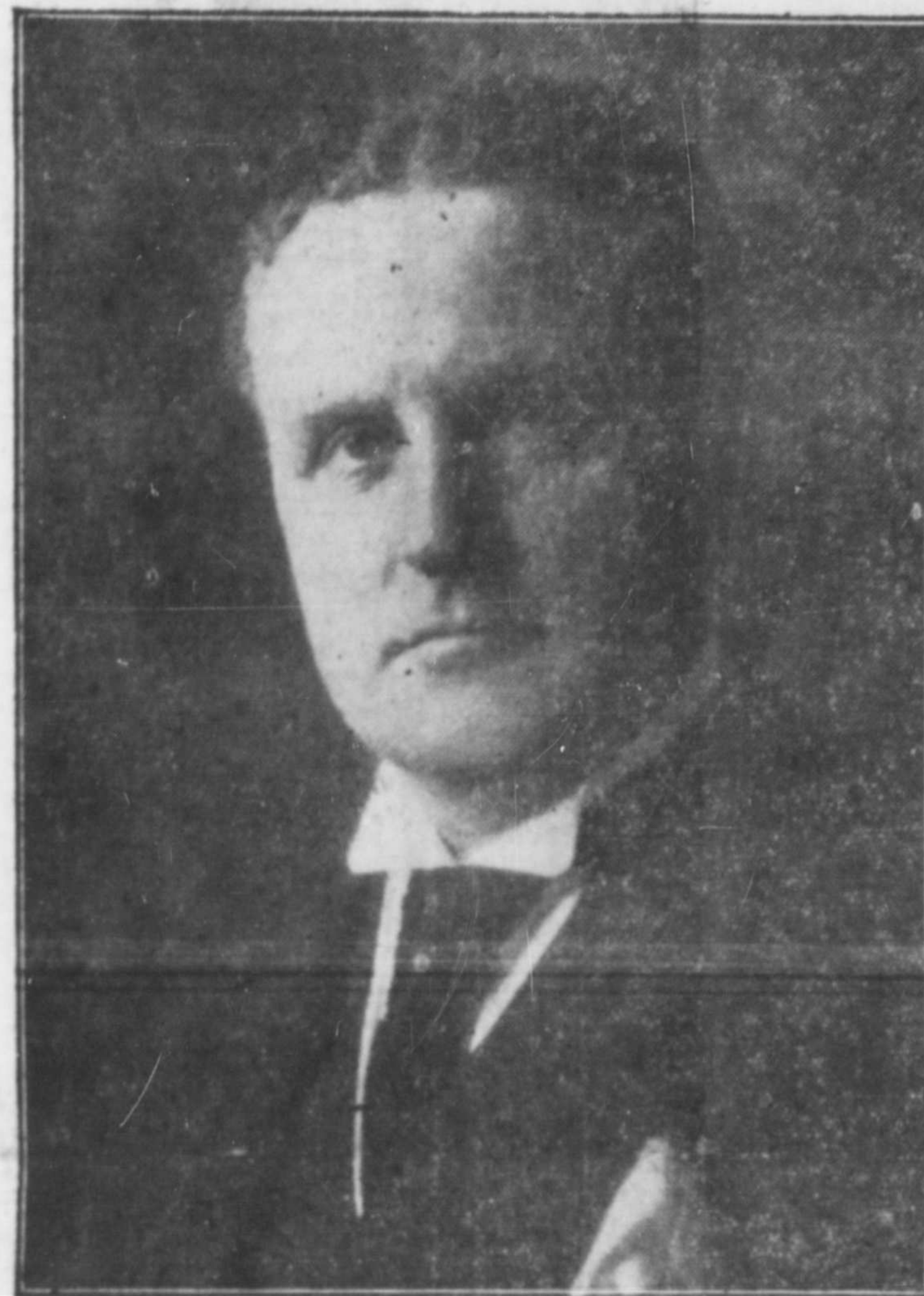
T. D. Pattullo, member re-elected of Legislature for Prince Rupert.