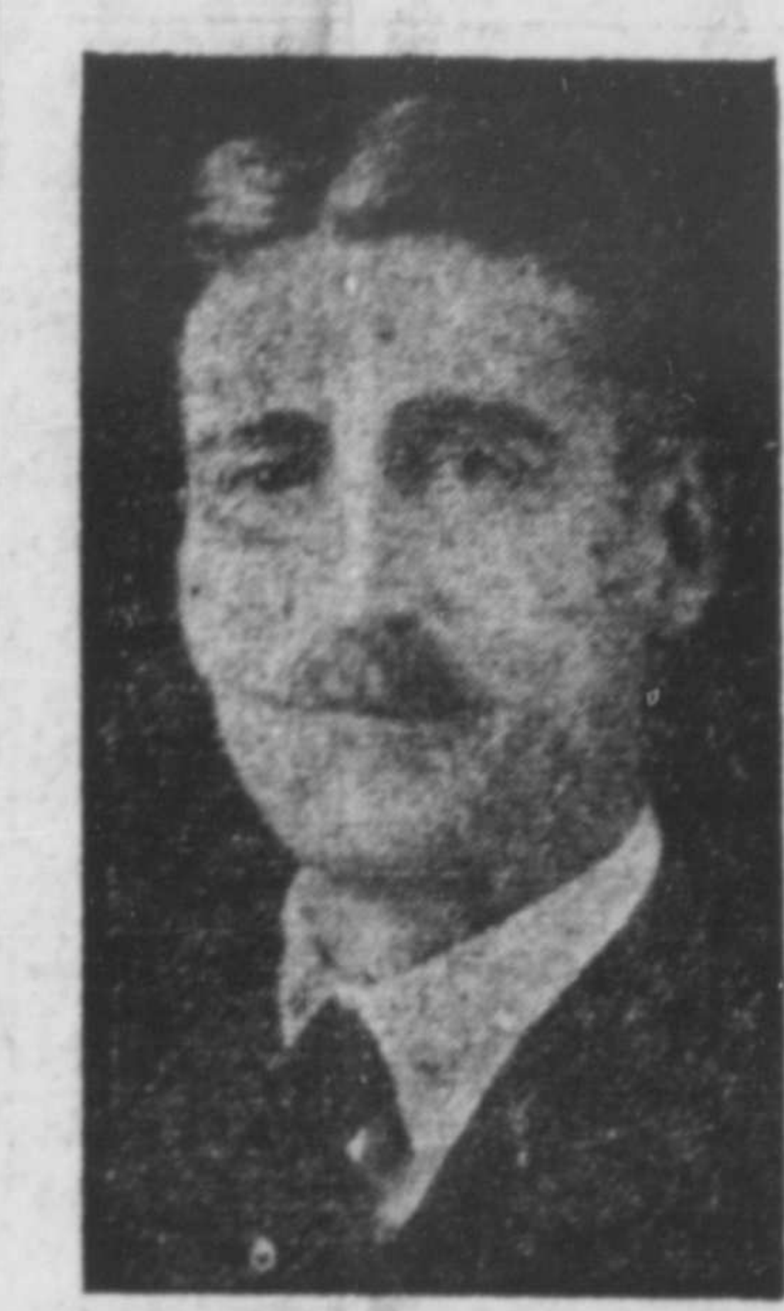
HON. IAN MACKENZIE M.P.