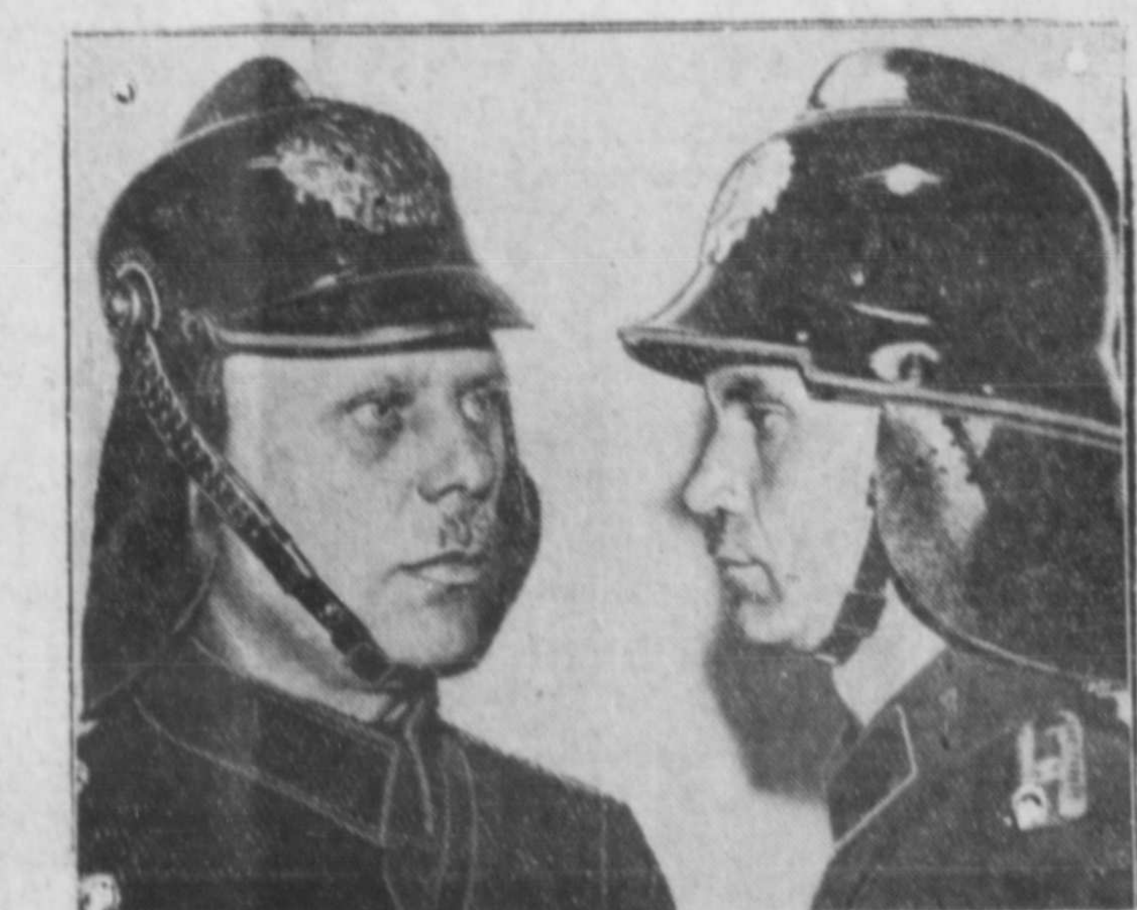
Looking around for something nice in stormy weather headgear? Well, the new helmets adopted by Berlin firemen prevent falling objects from giving you a pain in the neck.