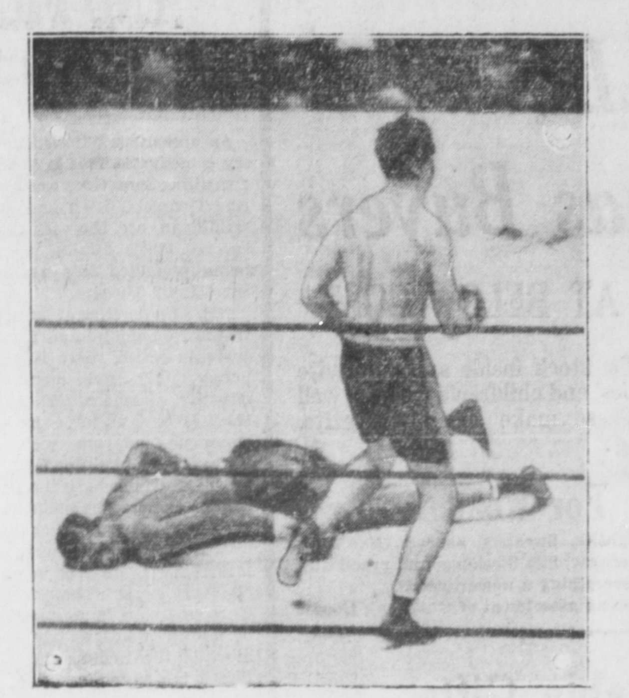
Kid Chocolate is seen lying prone on the canvas in Madison Square Garden, New York, as the drolful 10 seconds are counted out to make the Cuban Bon Bon's first knockout in 211 battles. Tony's right paw delivered the wallop in five minutes from start.