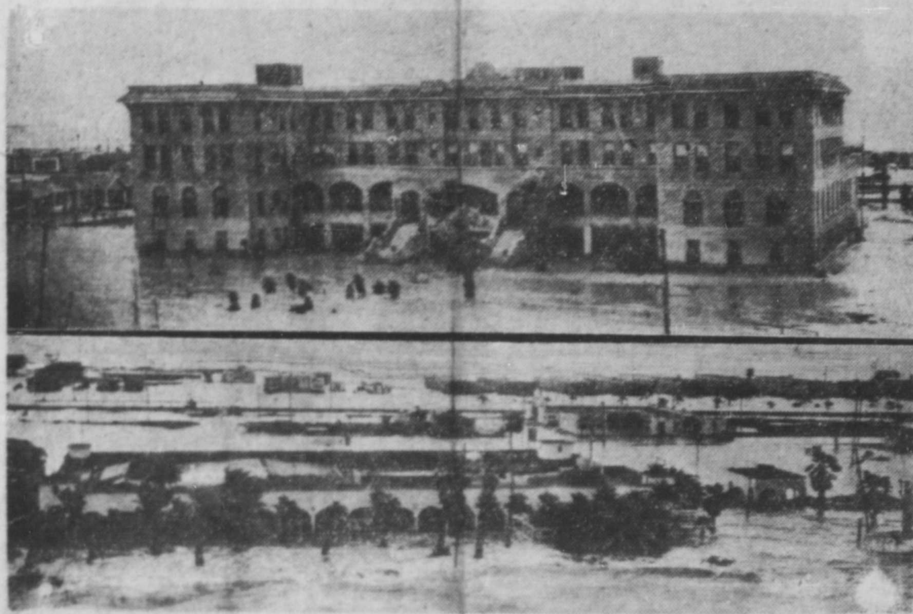
These scenes show the rising flood waters which inundated several Texas towns and cities in the wake of the fierce hurricane which swept the Gulf states after striking Cuba. A hotel at Corpus Christi, Tex., partly submerged by the flood, is pictured at the top. At the bottom is a view of North Beach, a pleasure resort at Corpus Christi, showing the high water around the pavilion and tourists' cabins in the background. Property damage amounted to the hundreds of dollars.