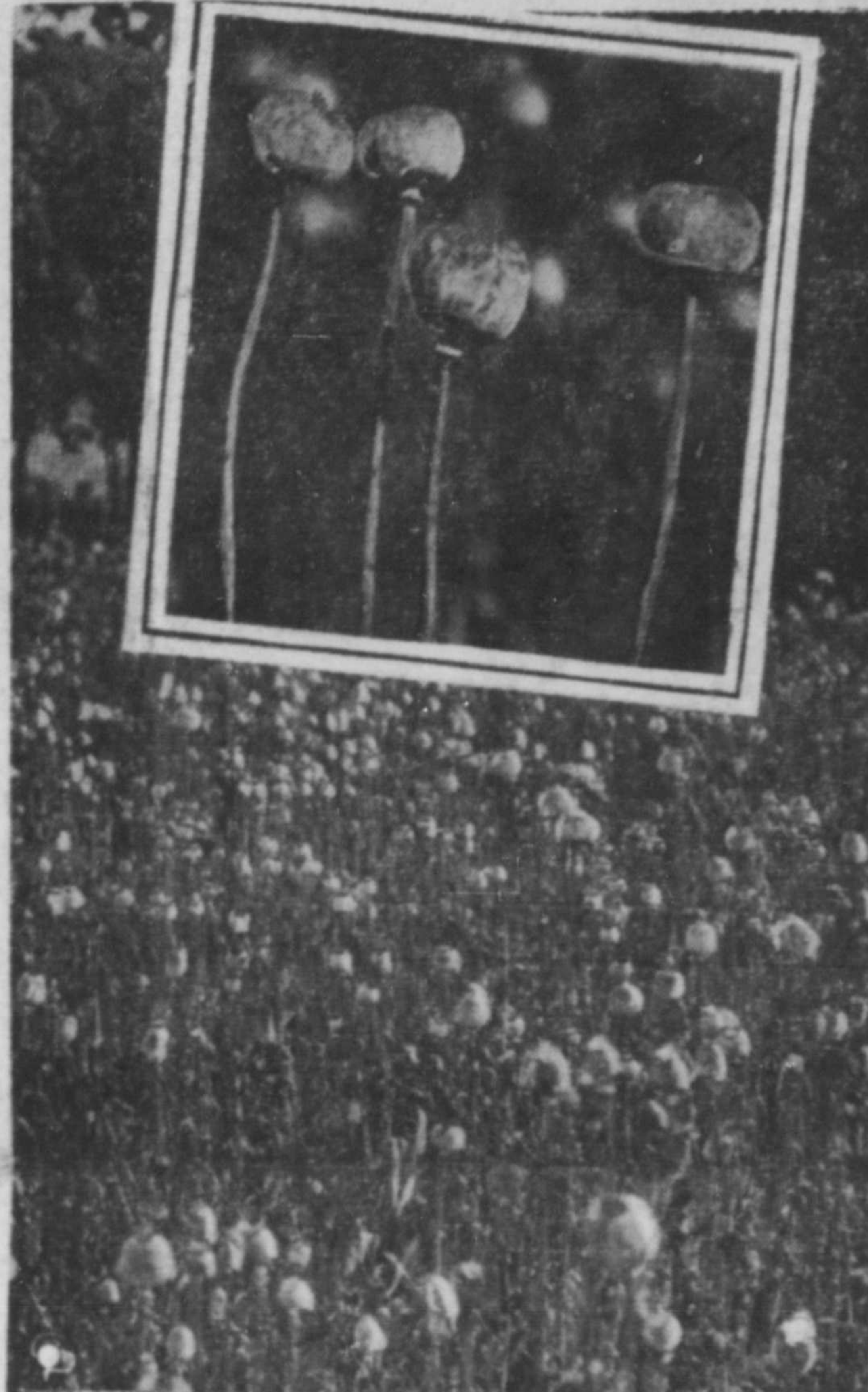
Opium poppies under cultivation near Victoria. Inset shows poppy heads enlarged. The seed pods are brewed into a tea, which contains eight per cent. morphine, and which when drunk has a stimulating effect on those who drink it. There is no law against growing opium poppies but it is illegal to harvest them.