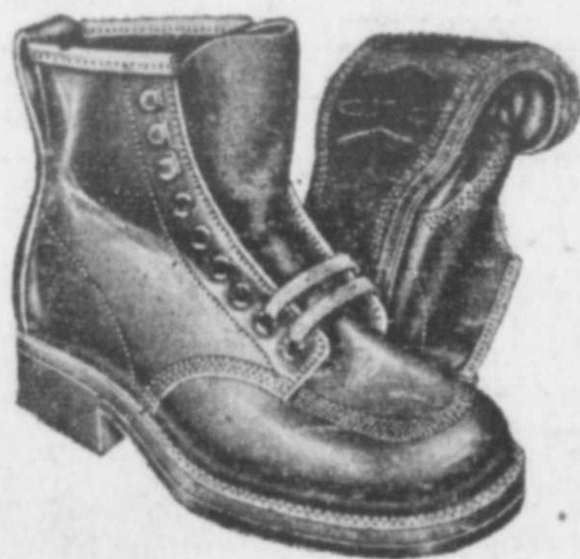
Leckie's High Grade Solid Leather Boots