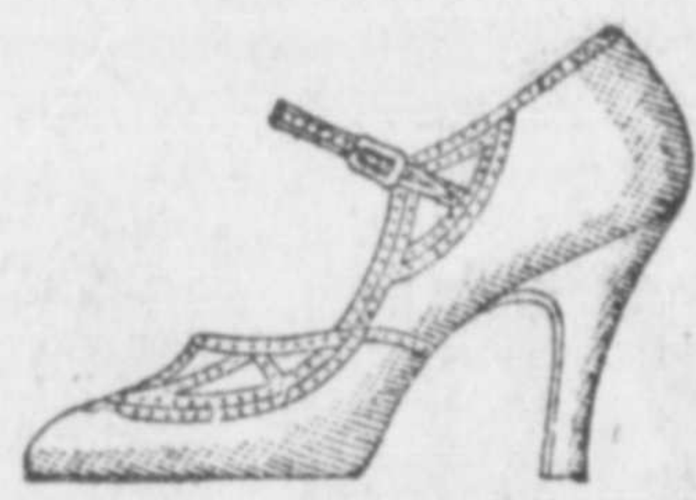
Snappy Styles for the Snappy Miss