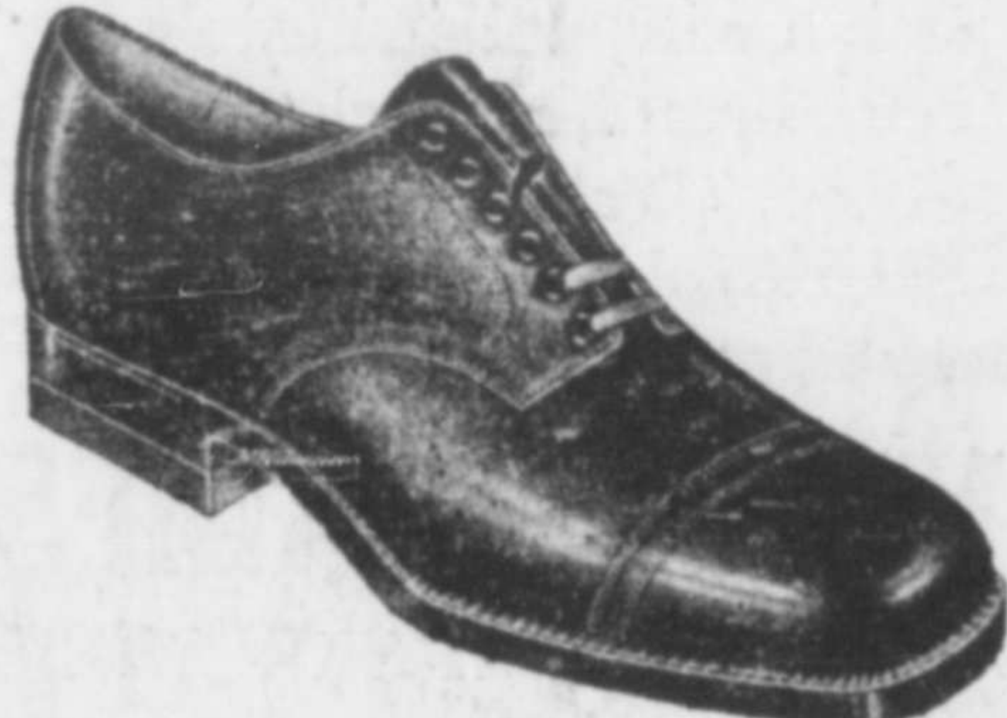
Men's, Boys' Youths' High Grade Oxfords