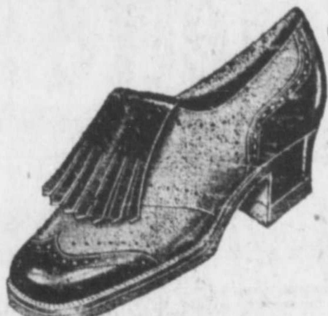
Smart, Servicable Oxfords for Women