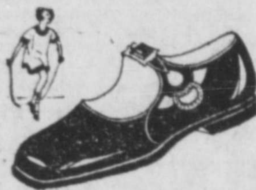
We specialize in Children's Footwear. Our prices will surprise and please you.