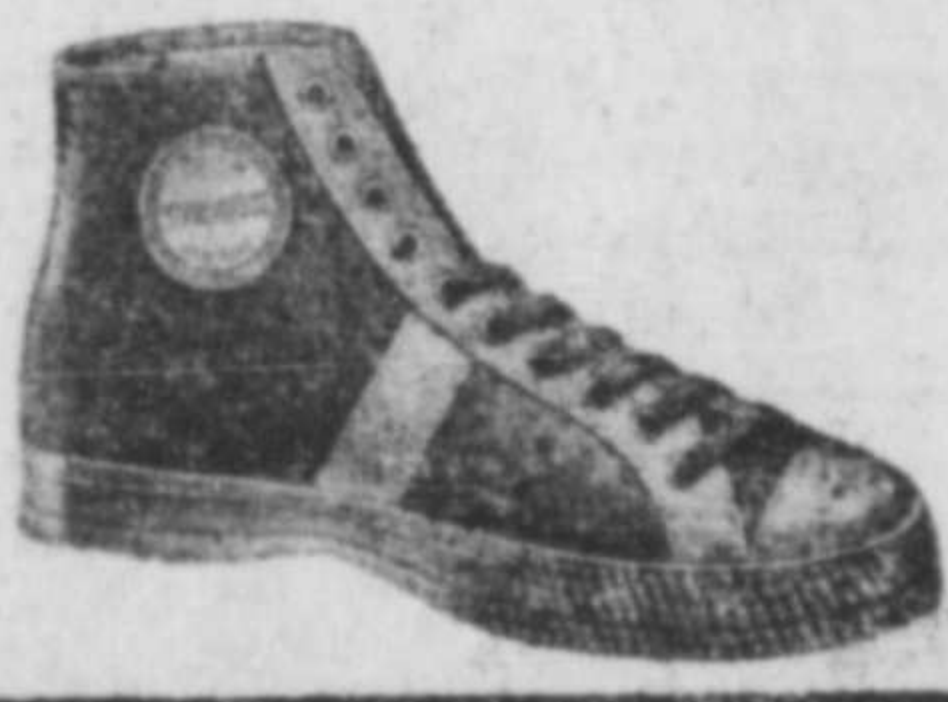
Running Shoes of all styles to fit the whole family.