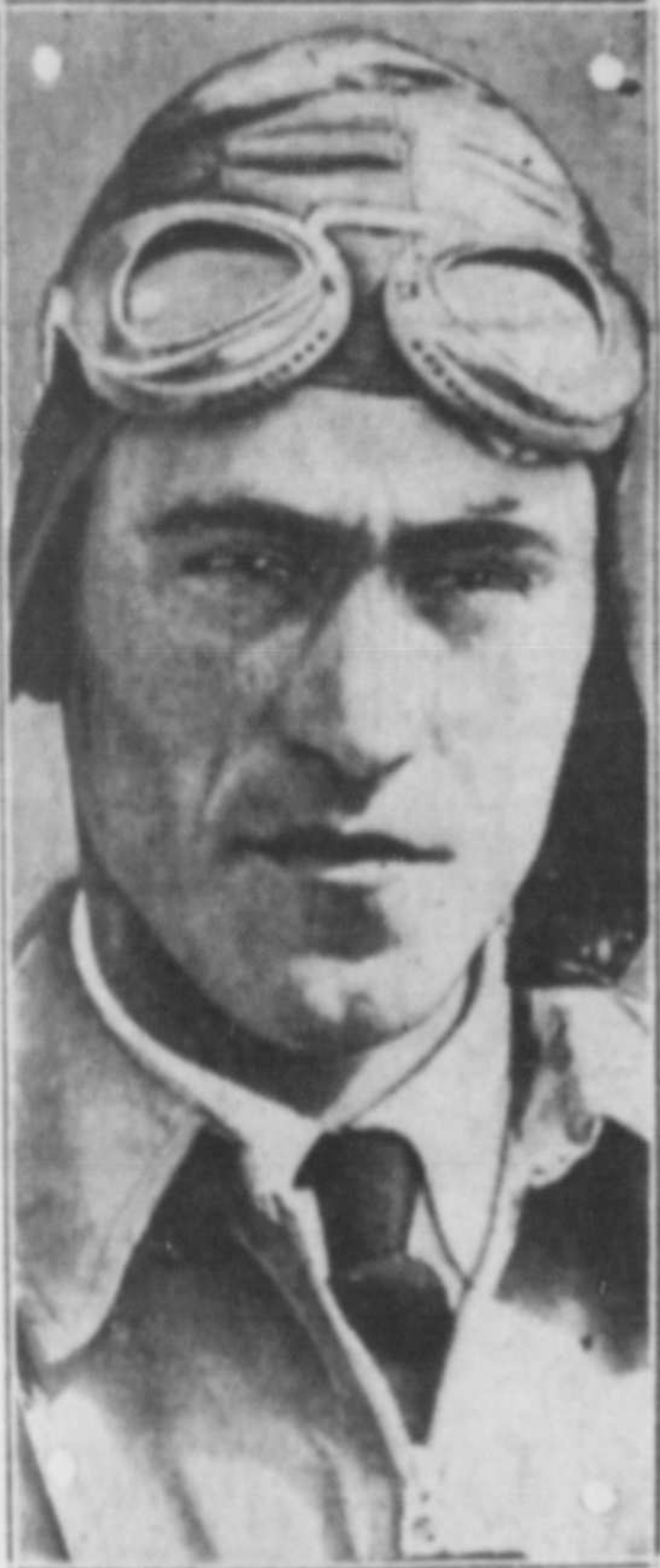
The world's fastest human is now Warrant Officer Francisco Agello, Italian ace, who flew 428 m.p.h. to better Britain's record by 35 kilometres per hour.