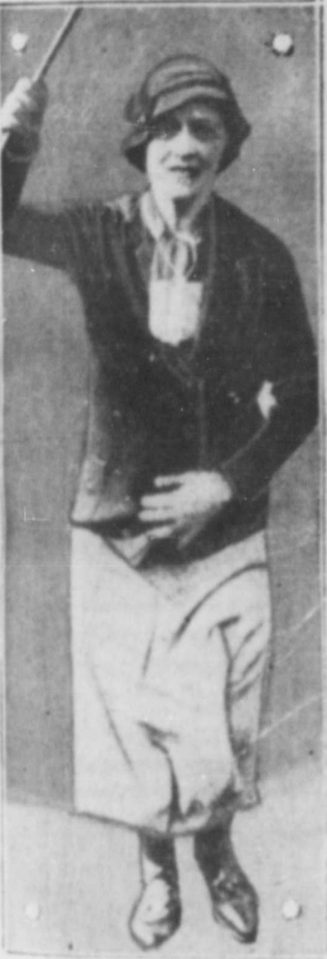
Got Nancy's nanny. Photograph isn't always a soft snap. Lady Astor didn't want her picture taken—chased cameraman with golf club.