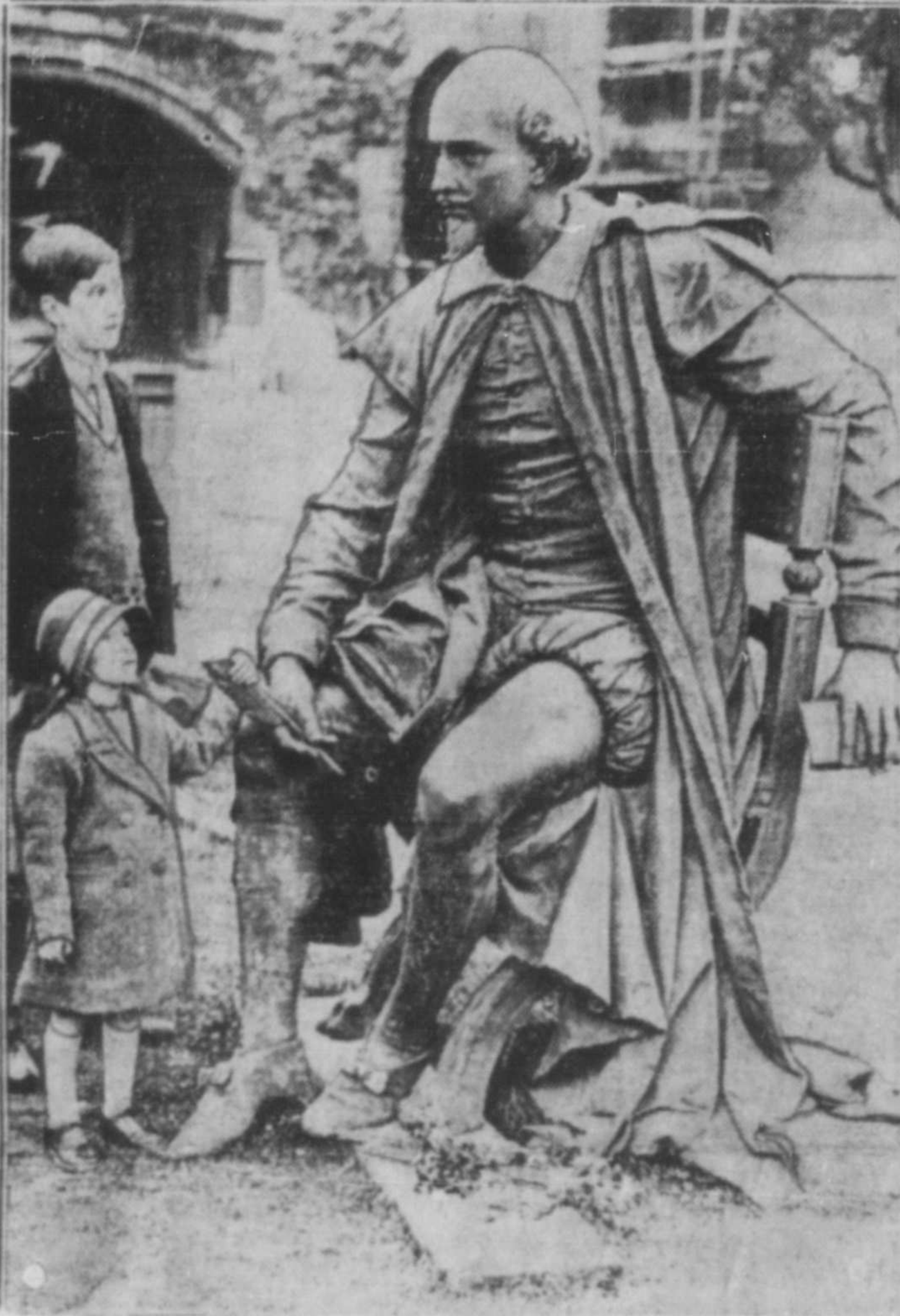
The statue of William Shakespeare by Lord Ronald Gower is seen here before being placed in front of the Shakespeare Memorial theatre at Stratford-on-Avon, England.