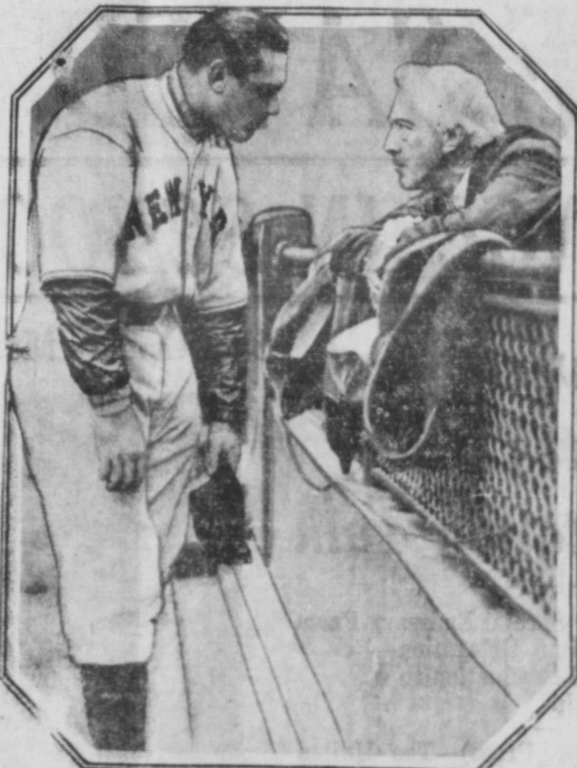
"Come here, Bill," says the judge, "how's the wrist?" This informal picture of Bill Terry, disabled manager of the New York giants, and Judge Kenesaw Mountain Lardis, high mogul of baseball, was snapped in Chicago recently. Sticking close to the dugout, Terry emerged for the flag-raising ceremony only to have Judge Lardis flag him down for a word or two. Here they are talking over a number of things, including the wrist injury that took Terry off first base.