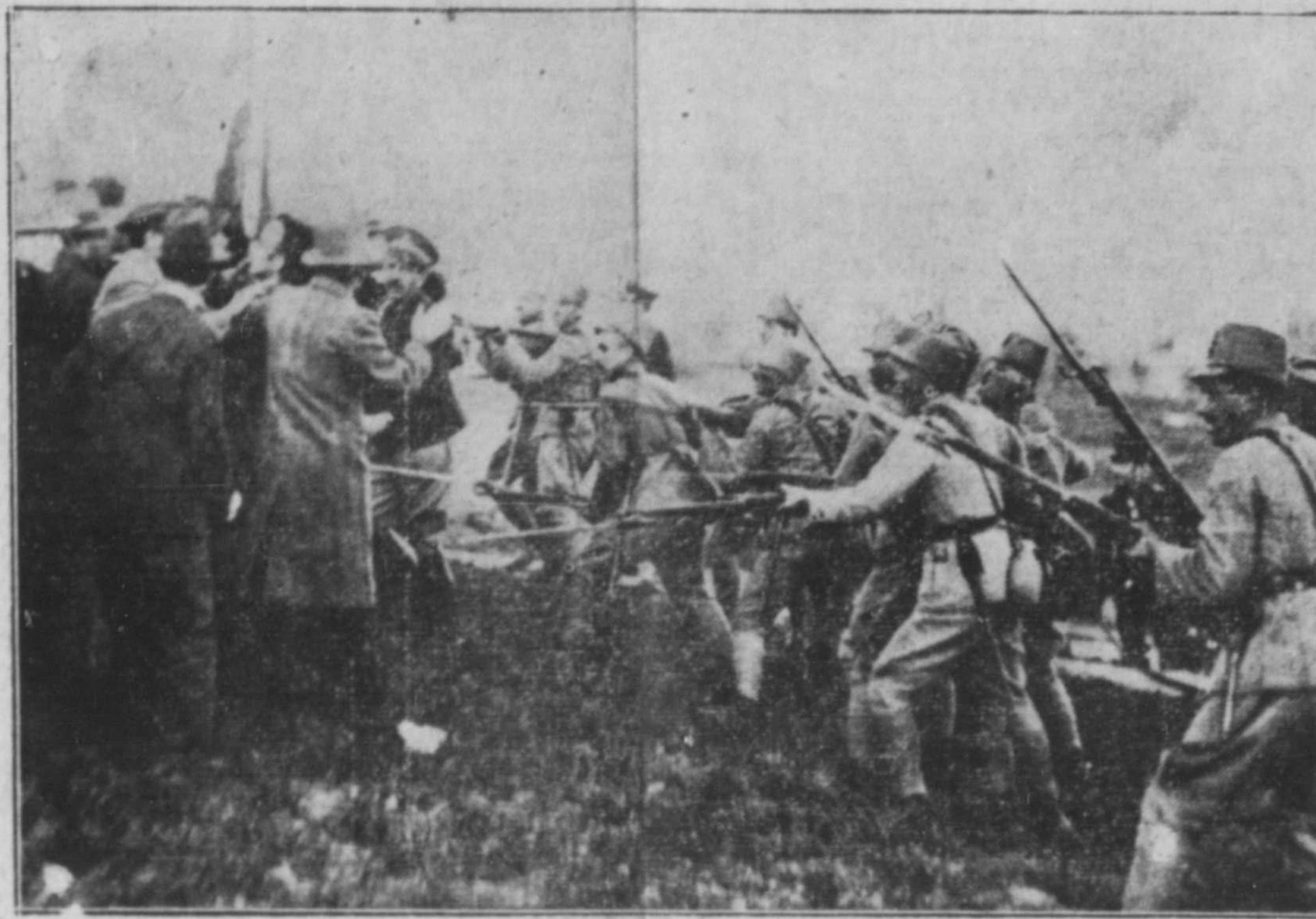
Turkish students, marching in protest on the Bulgarian consulate in Istanbul to protest against the desecration of Turkish graves by Bulgarians in Razgrad on Easter night, are halted with bayonet points by Turkish troops as they approach the consulate.