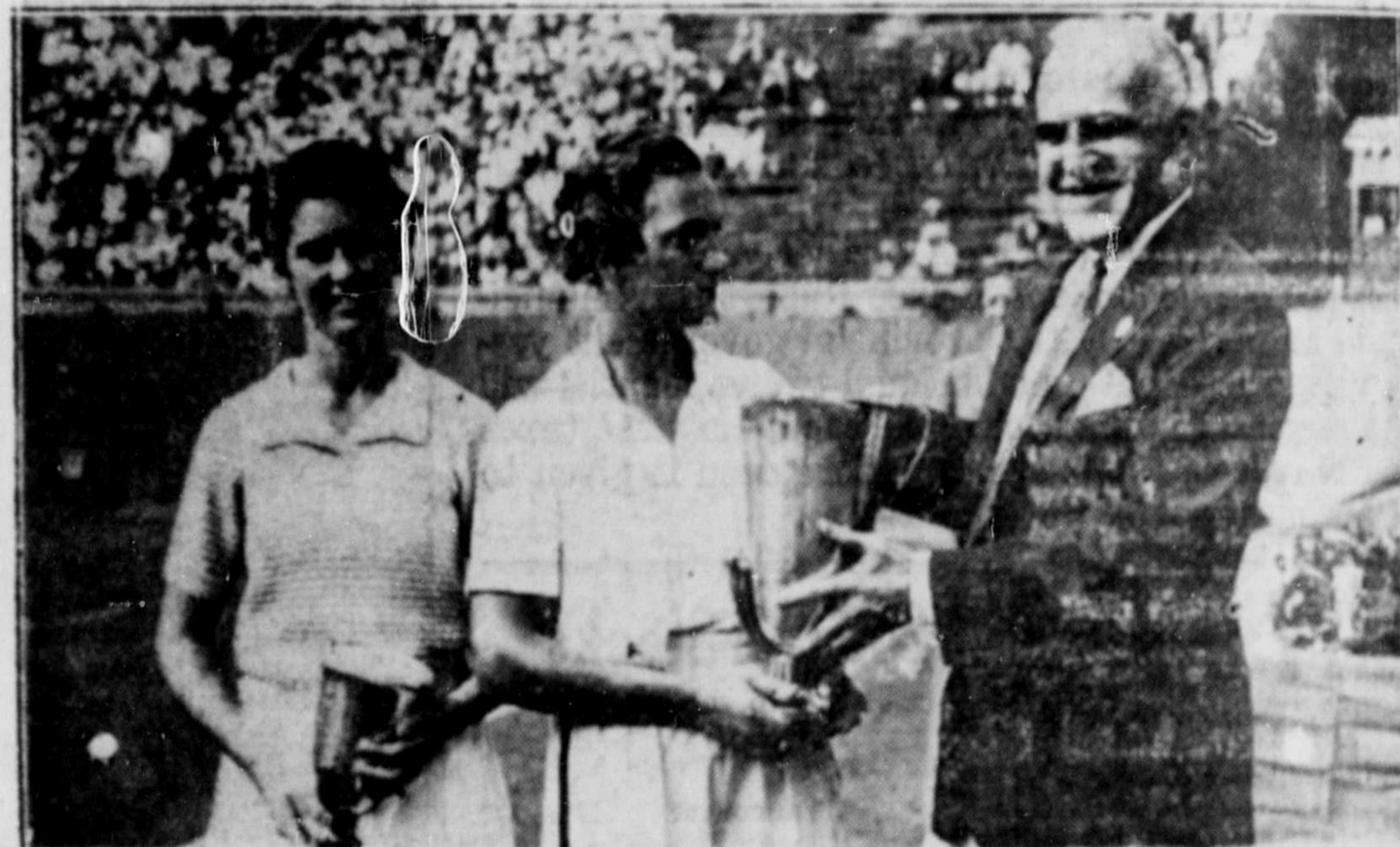
Sarah Palfrey, left, and Helen Jacobs receiving their trophies after Miss Jacobs defeated Miss Palfrey in Forest Hills, L.I., to retain her crown as the women's singles tennis champion of the U.S.