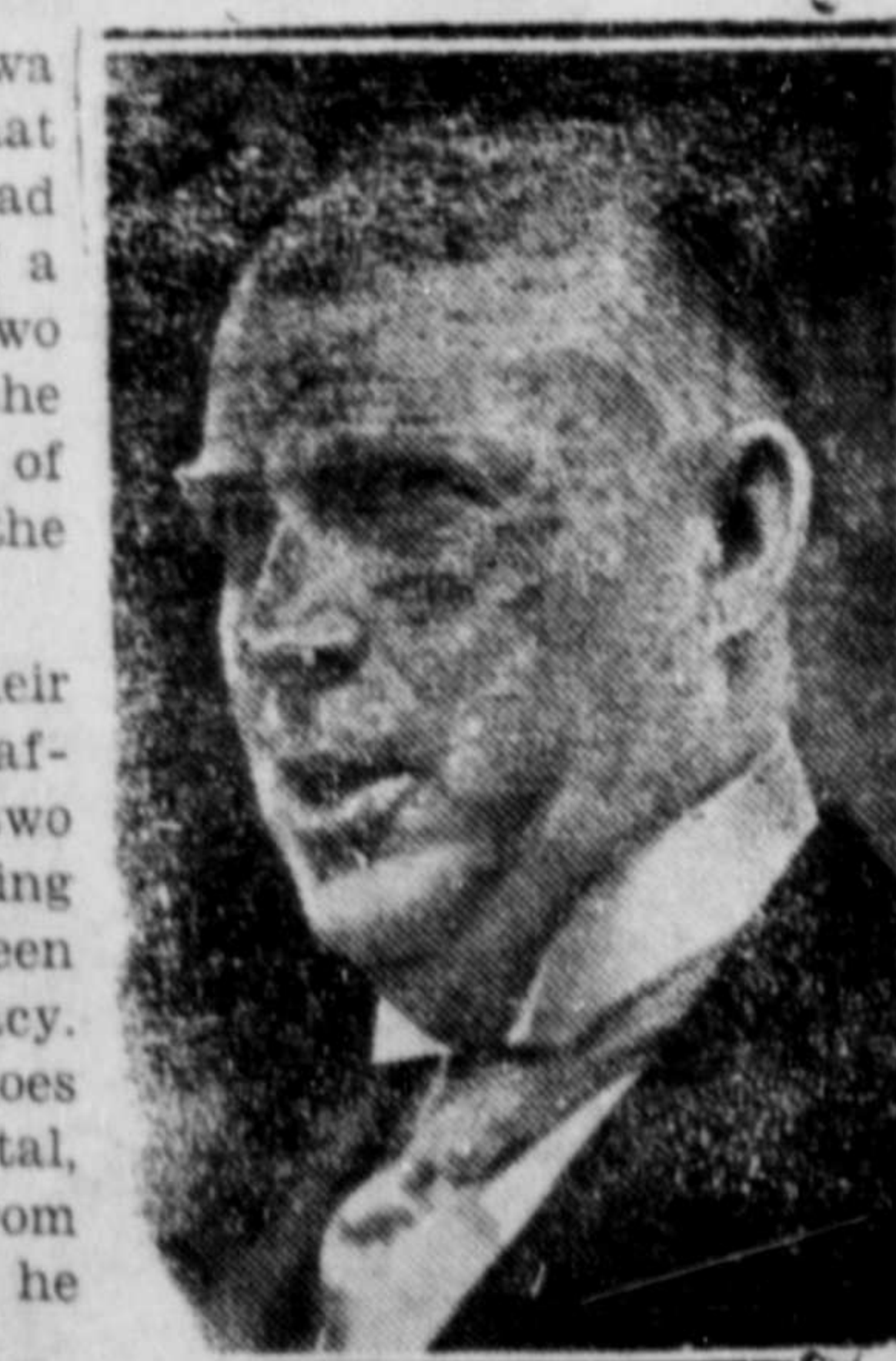
Rt. Hon. R. B. Bennett, Prime Minister of Canada

VICTORIA, Sept. 11:—It is announced by the provincial government that there are at present fewer people on relief in British Columbia than for the last two years. Improved conditions in the industries generally is stated to be the reason for the change for the better.