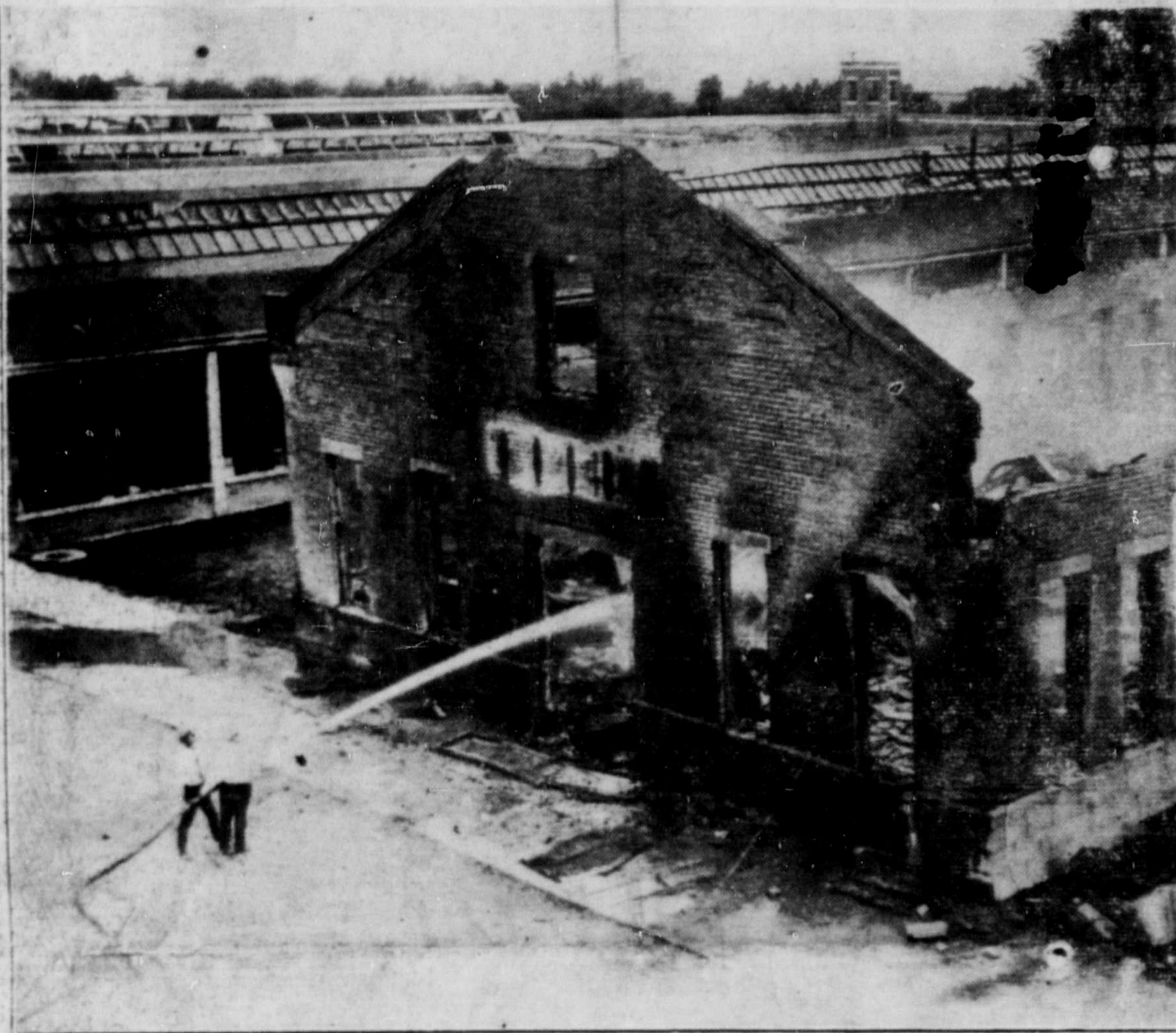
Firemen putting out the flames after the printing shop of the State Reformatory at Pontiac, Ill., was set afire when the 2,400 inmates attempted a mass escape that resulted in the death of one convict and the wounding of twenty-four.