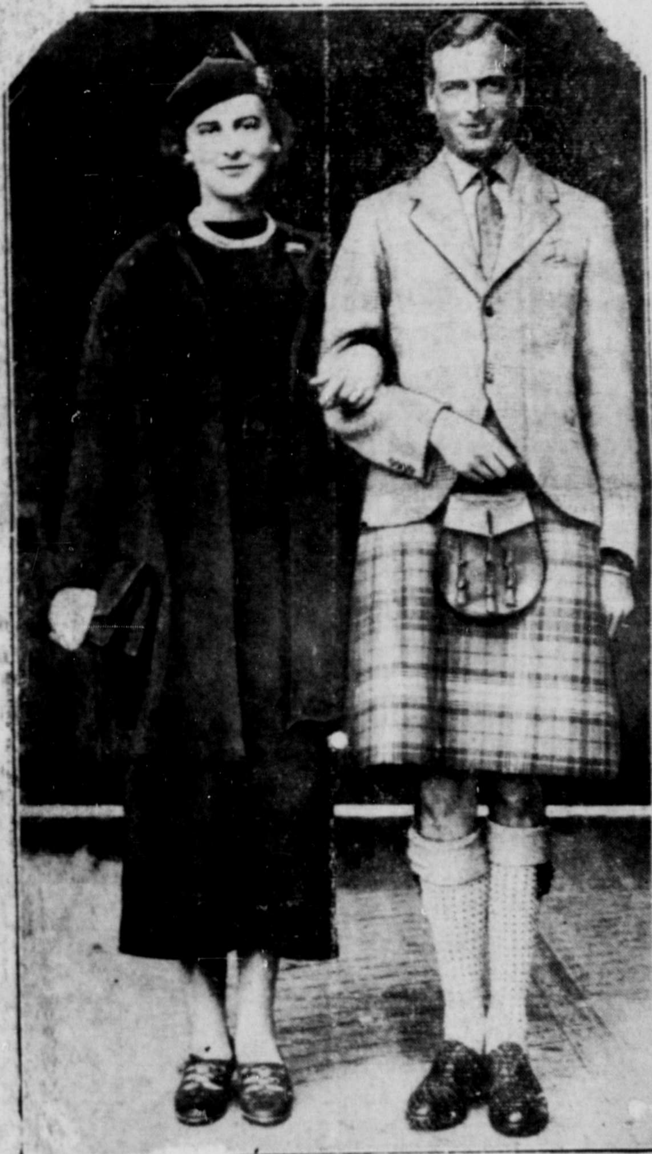
H.R.H. Prince George and his fiancée, Princess Marina of Greece, at Balmoral castle, Scotland, from where their wedding date, November 29, was announced.