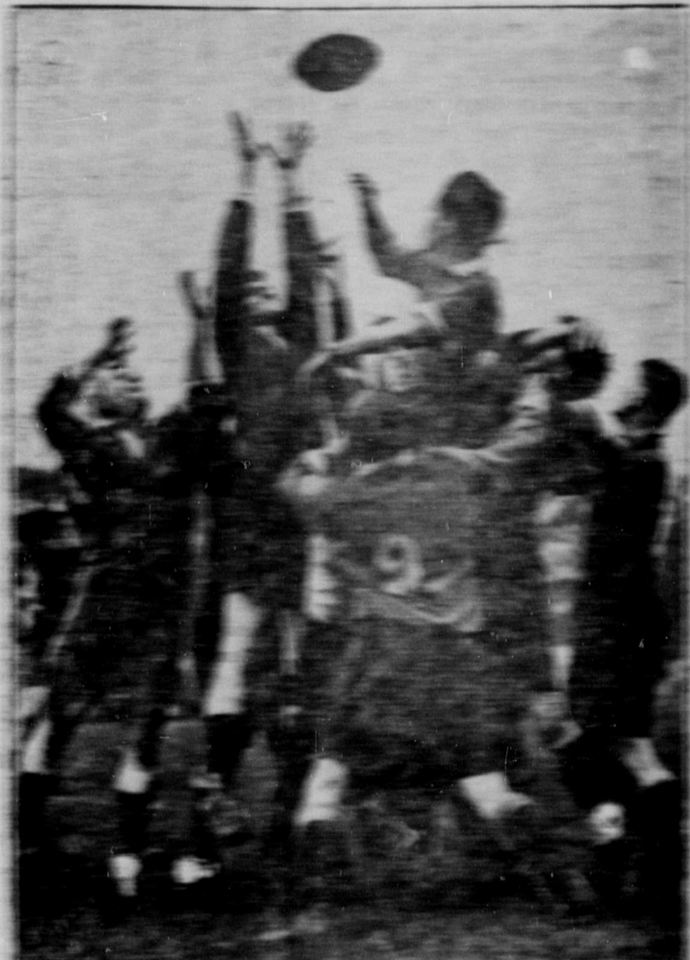
Apparently all the players in this picture have the same object in mind. This bit of action took place during the early game between Lumber, Welsh and Richmond at Richmond, England.

Both teams scored the rest of some of the crowd by the handling of some questionable decisions.