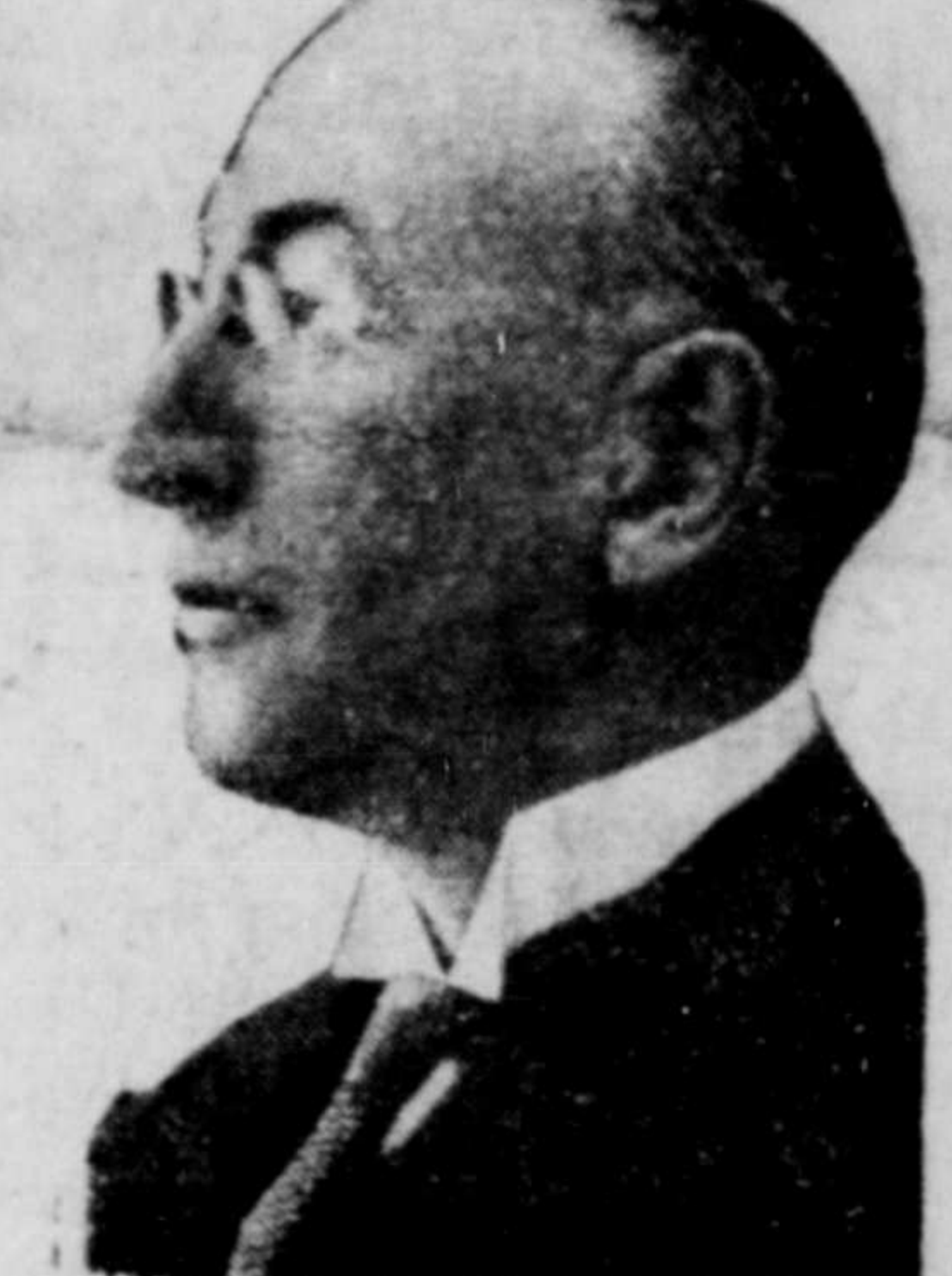
HON. E. N. RHODES

OTTAWA, March 23:—It is believed that Hon. Edgar Nelson Rhodes, minister of finance, will be offered the position of first governor of the new Bank of Canada, the Dominion's first central banking institution.