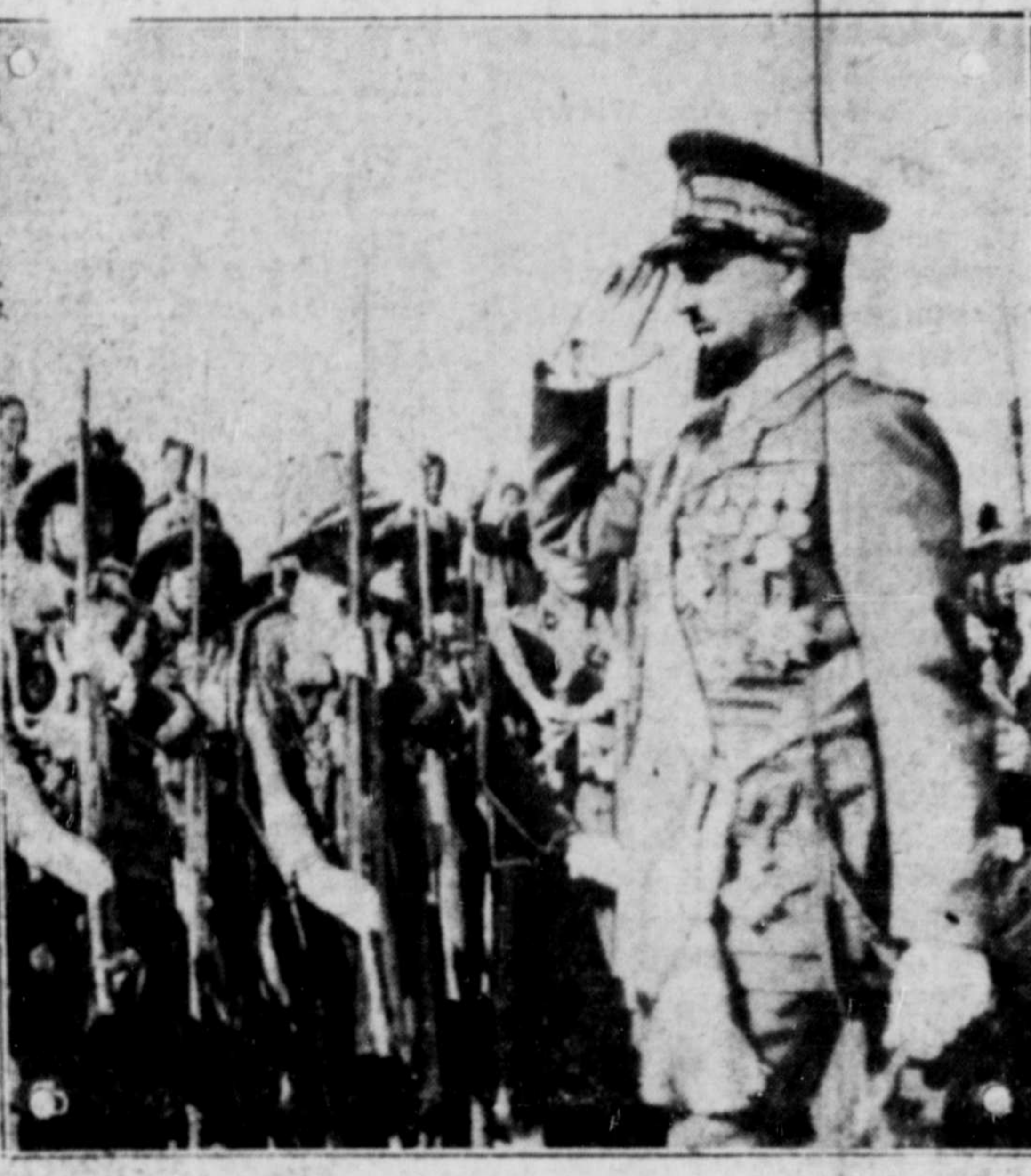
General Balbo, famous Italian flier who led the mass formation flight from Italy to Chicago, as he arrived in Tripoli. The general is on his way to Italian province of Libya, where he will be governor. It is whispered that Balbo was shifted to Africa because he was getting too popular in Italy.