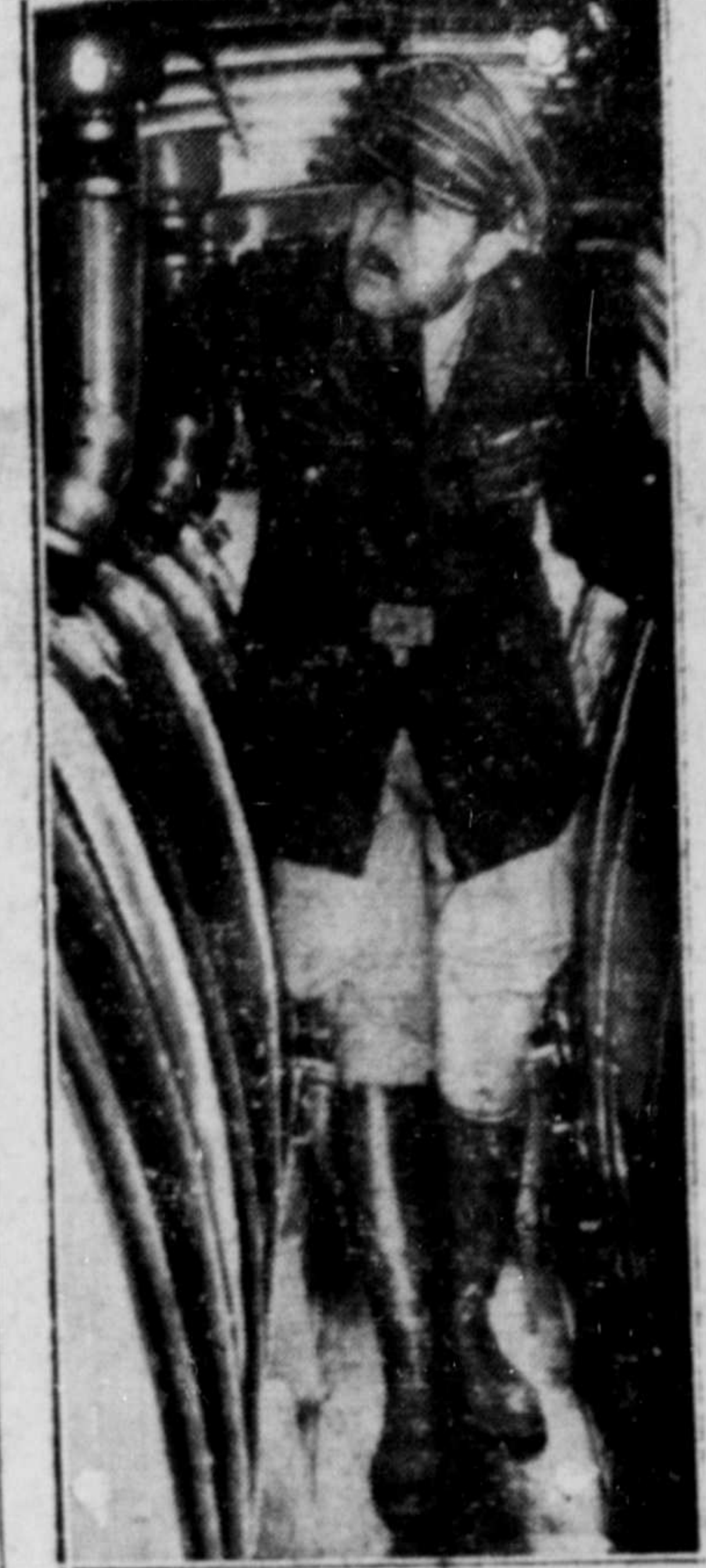
Col. Roscoe C. Turner inspecting the aeroplane in which he and Clyde Pangborn will enter in the London to Melbourne air race this week-end.