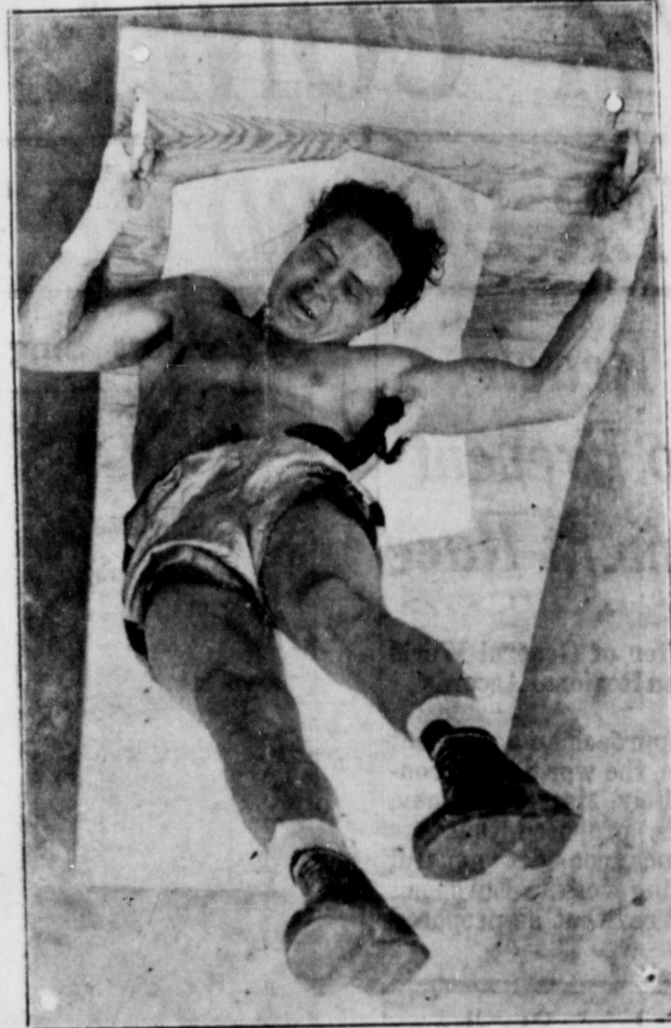
Max Baer, at his training quarters at Asbury Park, N.J., is putting in heavy work in preparation for his coming battle, June 14, with Carnera. He is shown doing his callisthenics.