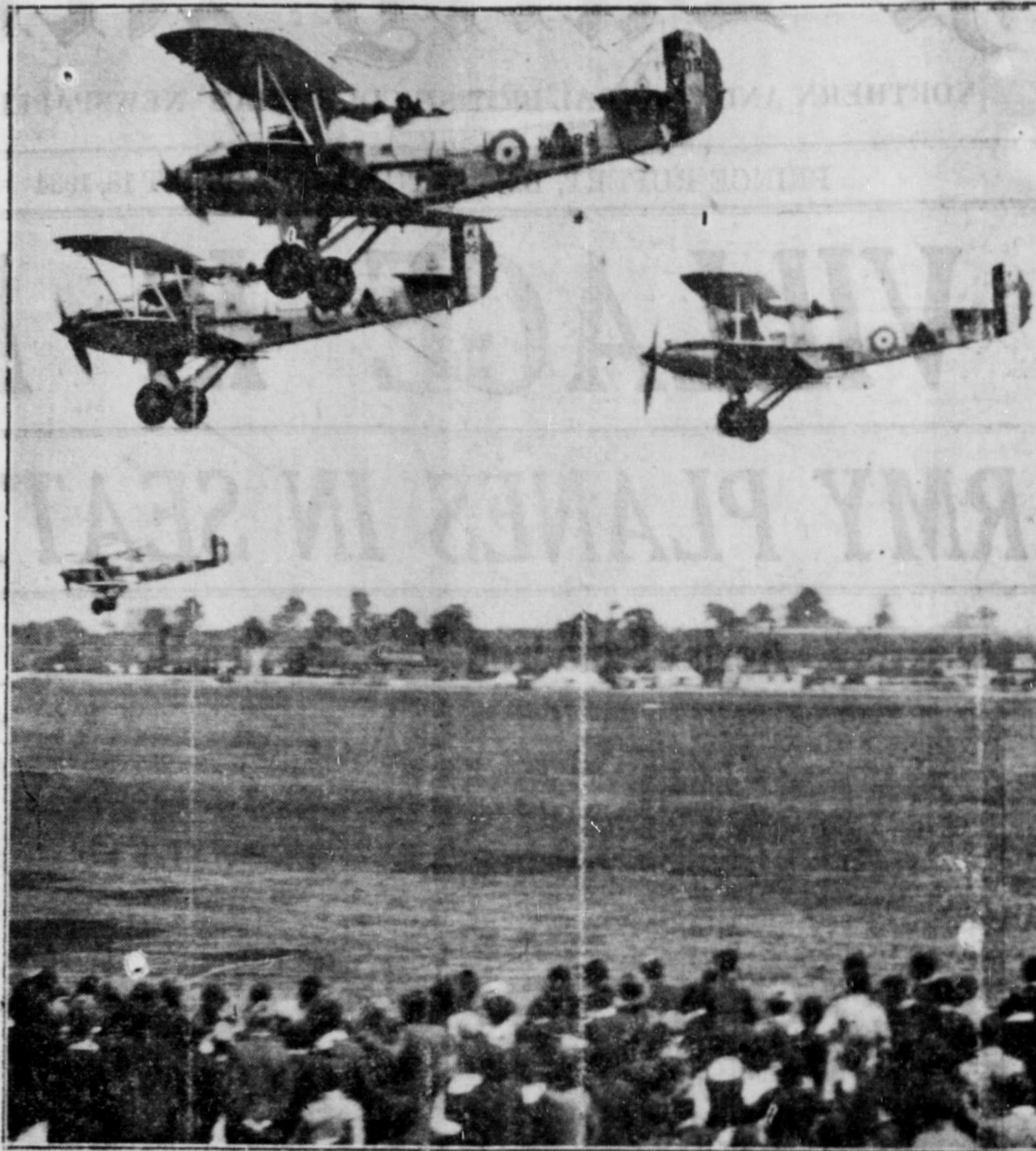
The full dress rehearsal of the Royal Air Force display at Hendon was witnessed by thousands of school children. The picture shows Army Co-operation Squadron diving to pick up messages, while thousands of upturned eyes follow the manoeuvre.