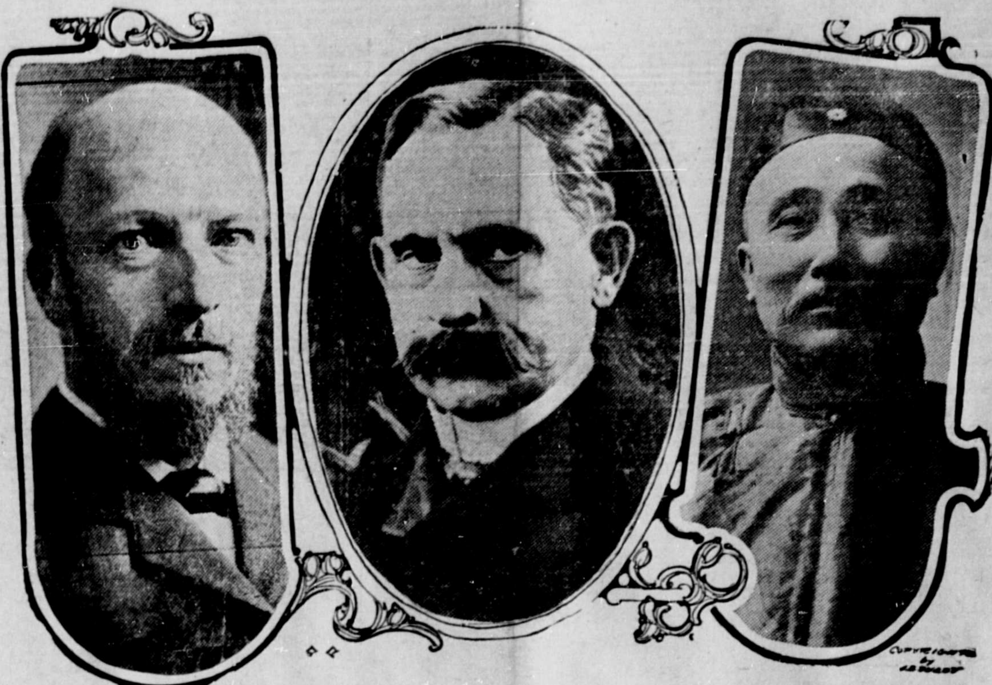
Reading from left to right:—Dr. Felix Adler, of New York; Baron de Constant, famous peace advocate and Wu Ting Fan, who will represent the Chinese nation at the Congress.

LEADERS AT THE INTERNATIONAL RACES CONGRESS