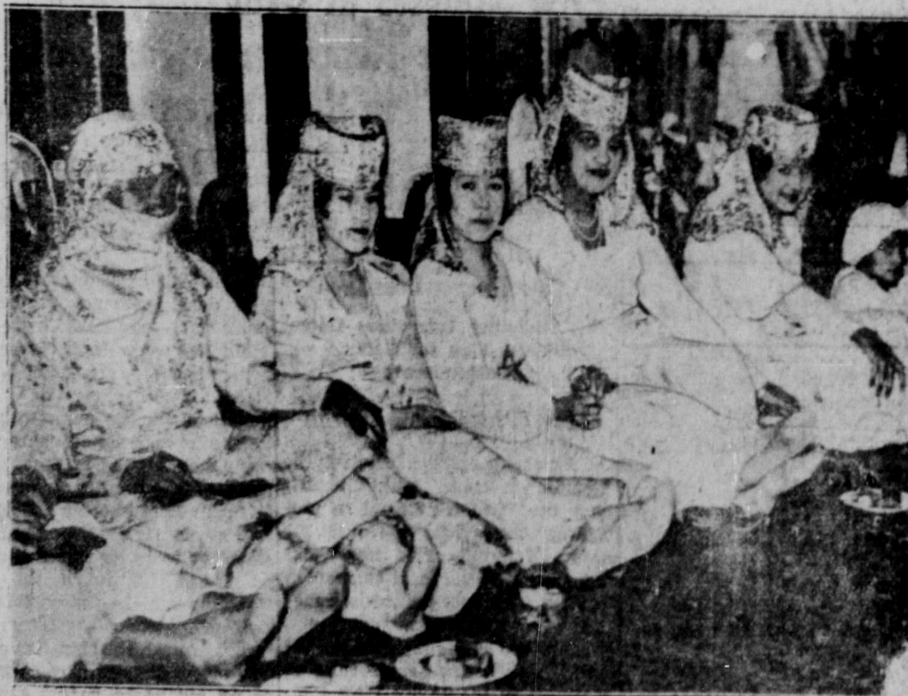
Malay women in their picturesque costumes at the Aspeling mosque, Cape Town, South Africa, celebrating the Feast of the Holy Prophet after many months of preparation.