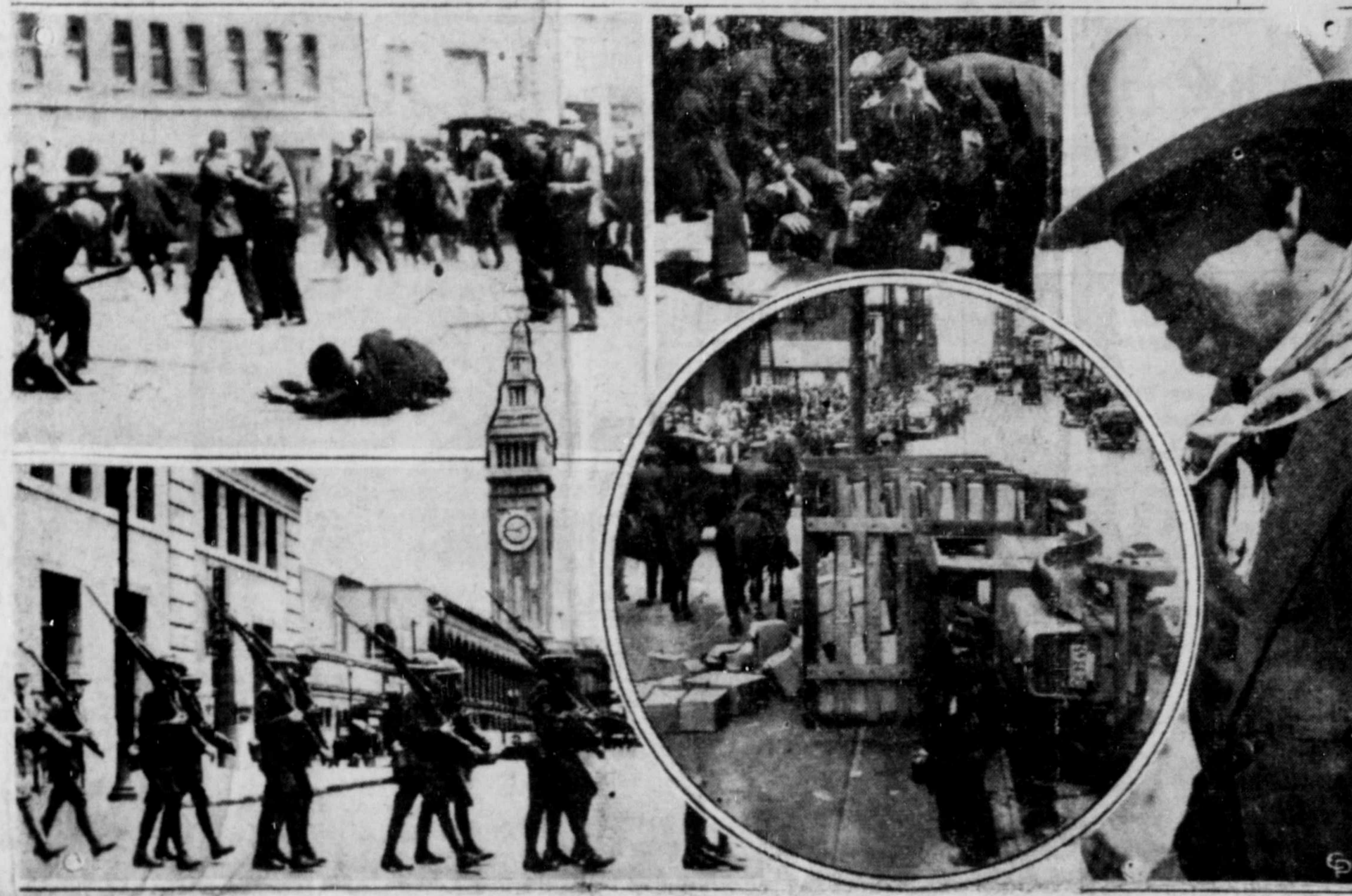
With thousands of workers out on strike, in sympathy with the onshoremen and dockmen who had been on strike for two months, San Francisco was in a turmoil. Martial law was declared. The effects were being felt as far north as Vancouver, where longshoremen refused to unload vessels they claimed were unfairly loaded. The layout shows Governor Frank F. Merriam, who had held that post for only a month and who faced the gravest problem any governor in the U. S. had had to face in years. Other photos show scenes from recent disorders in which at least three were killed, and state troopers marching in to gain advantage points.