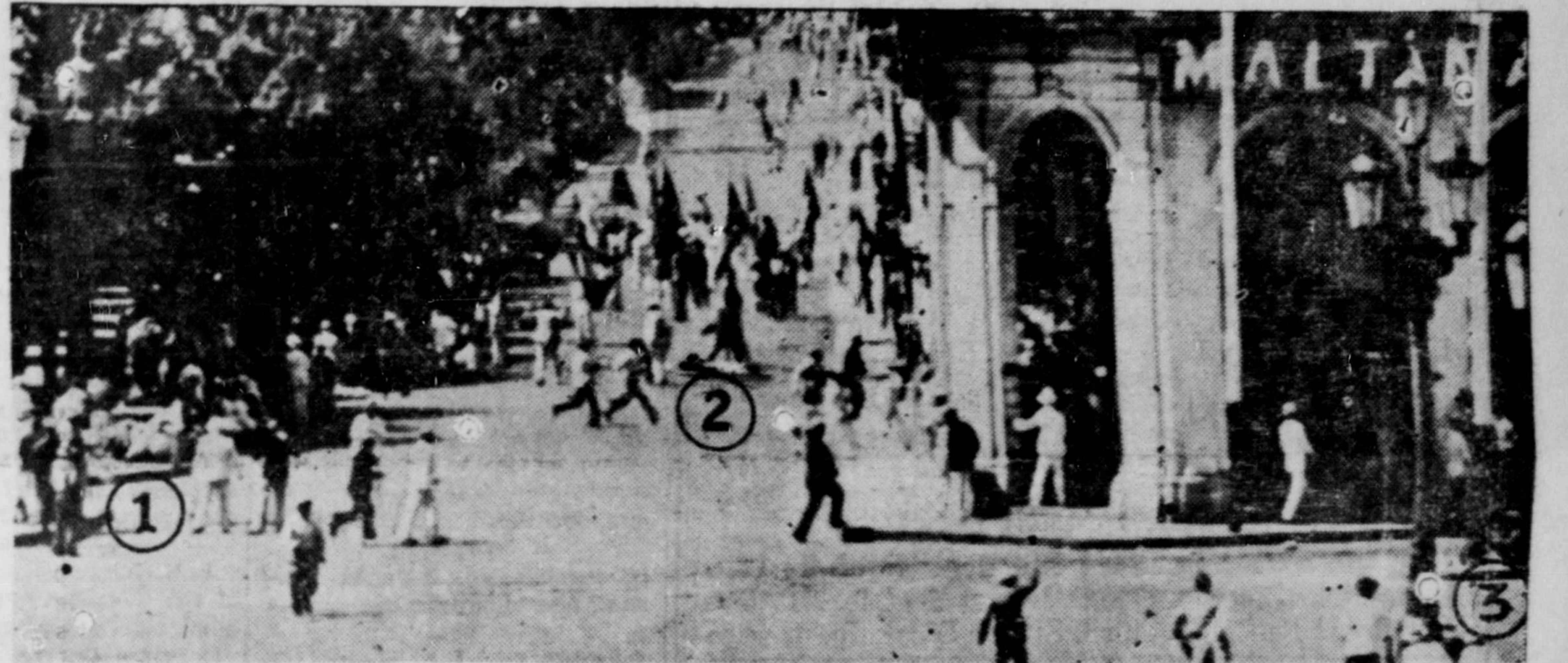
A political parade of young students in a street of Havana, Cuba—the sudden spat-spat of machine guns—and death and terror swiftly follow. This remarkable picture shows actual fighting in which ten members of the student organization were killed and more than 40 wounded. No. 1 designates the location of machine gunners and some of the wounded. No. 2 marks a dead man in the middle of the street. No. 3 shows some of the paraders behind a lamp post, using their pistols to return the fire.