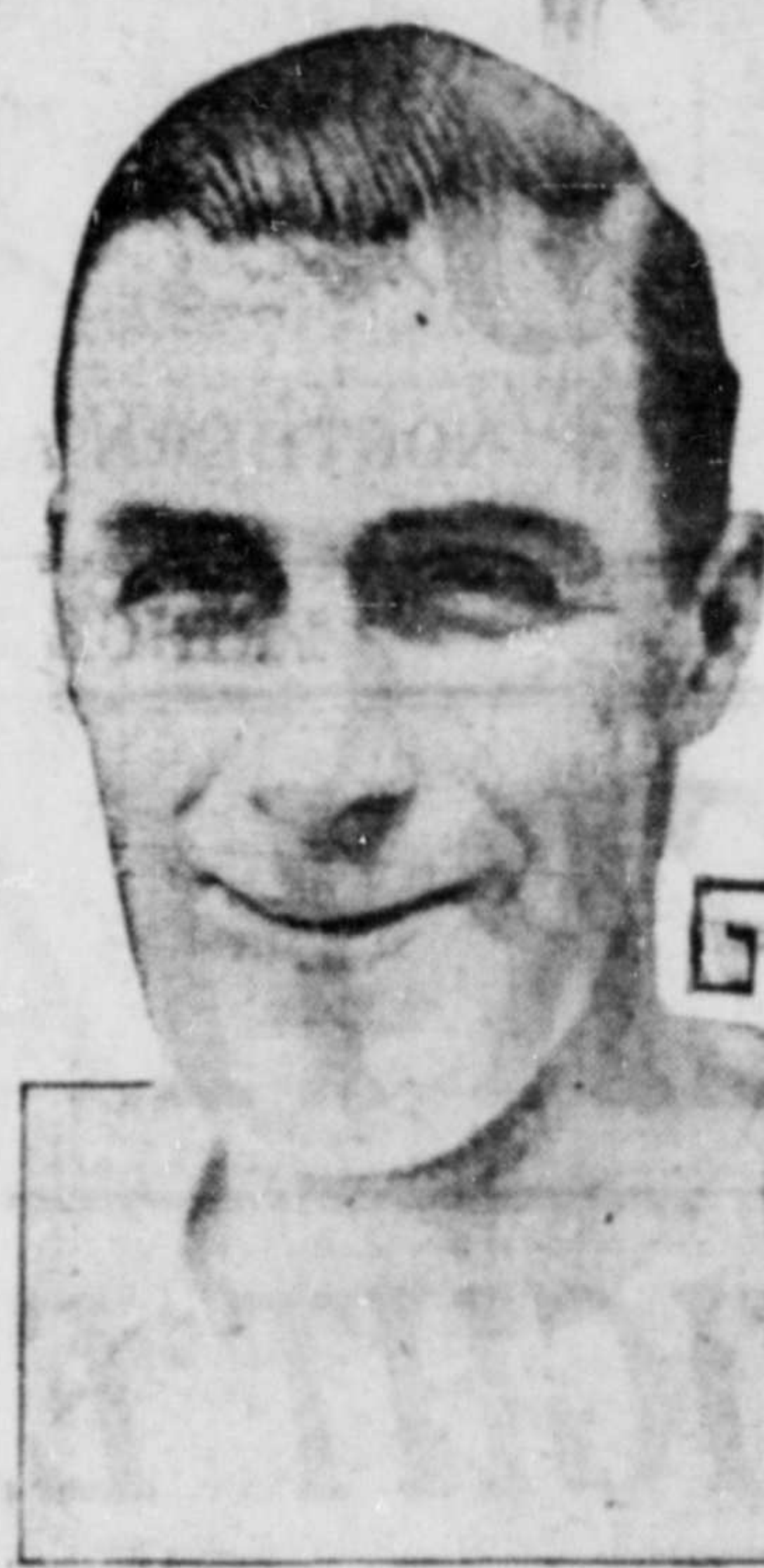
W. T. TILDEN