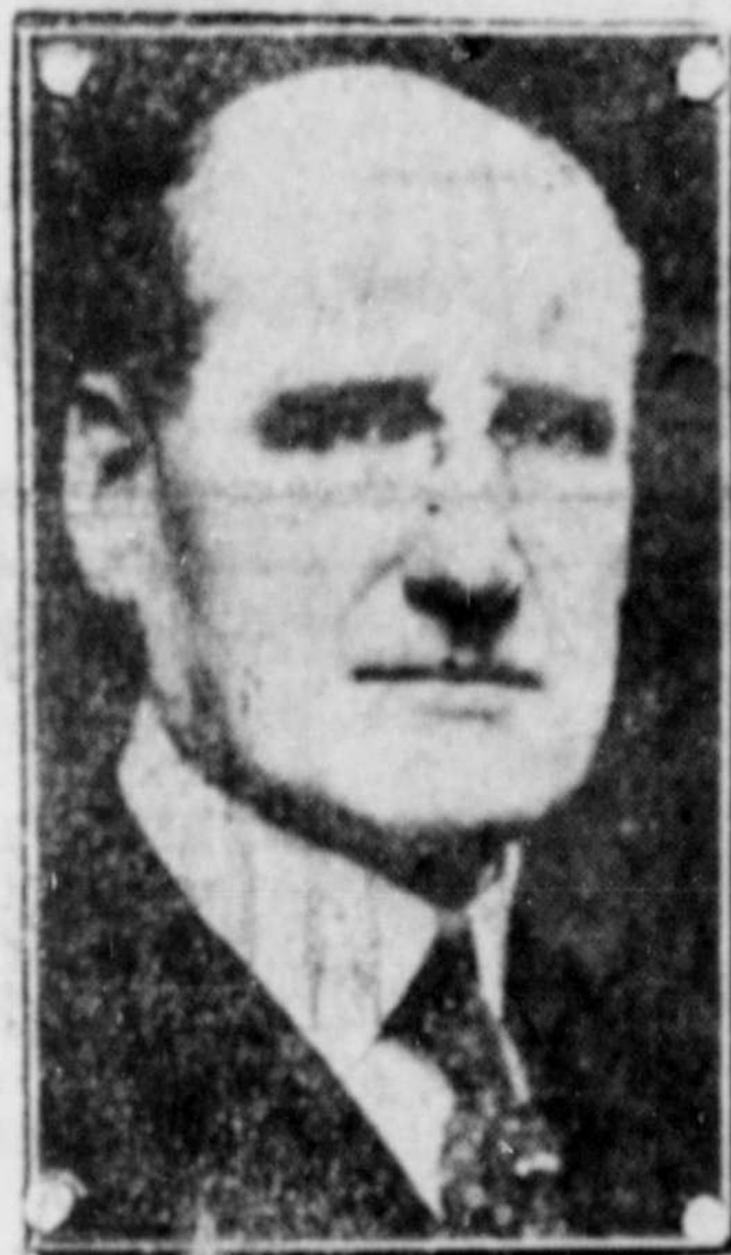
Hon. E. B. Ryckman, former minister of national revenue.