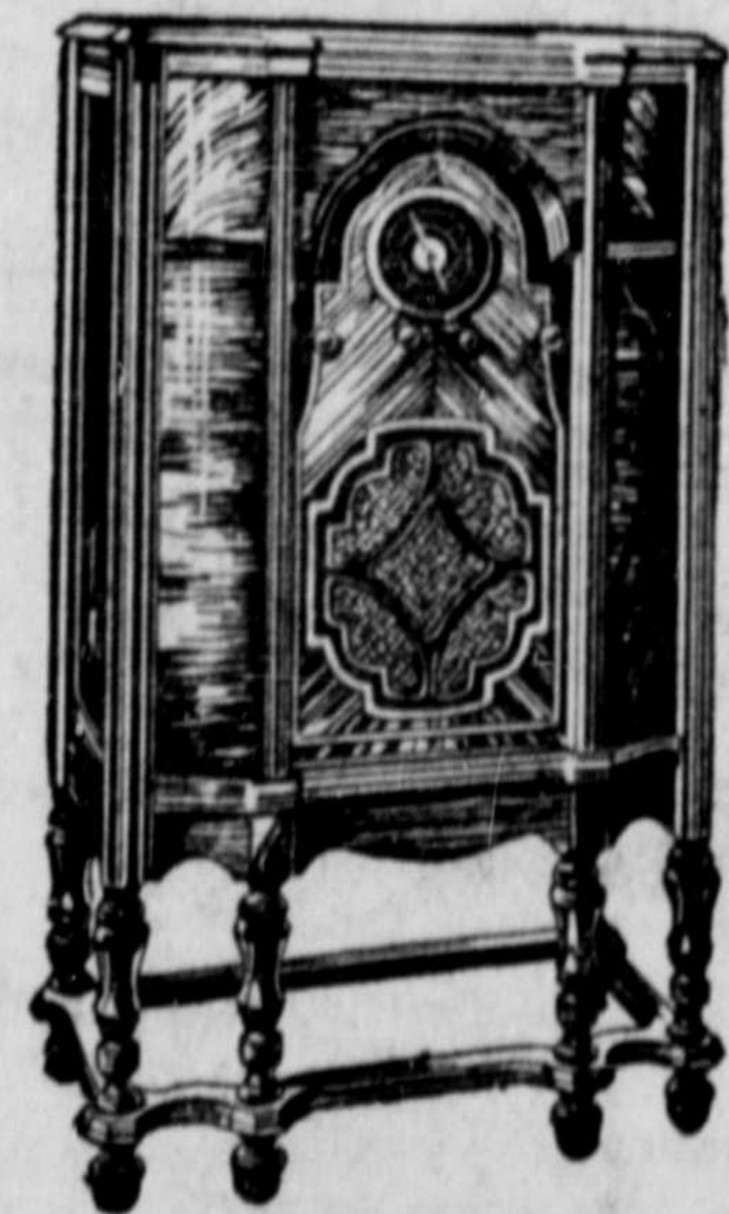
Victor Model 221 Selective Wave $124.50 Complete with tubes

Also All-Wave Battery Radios at $89.50 and $119.50 including Tubes, less Batteries.