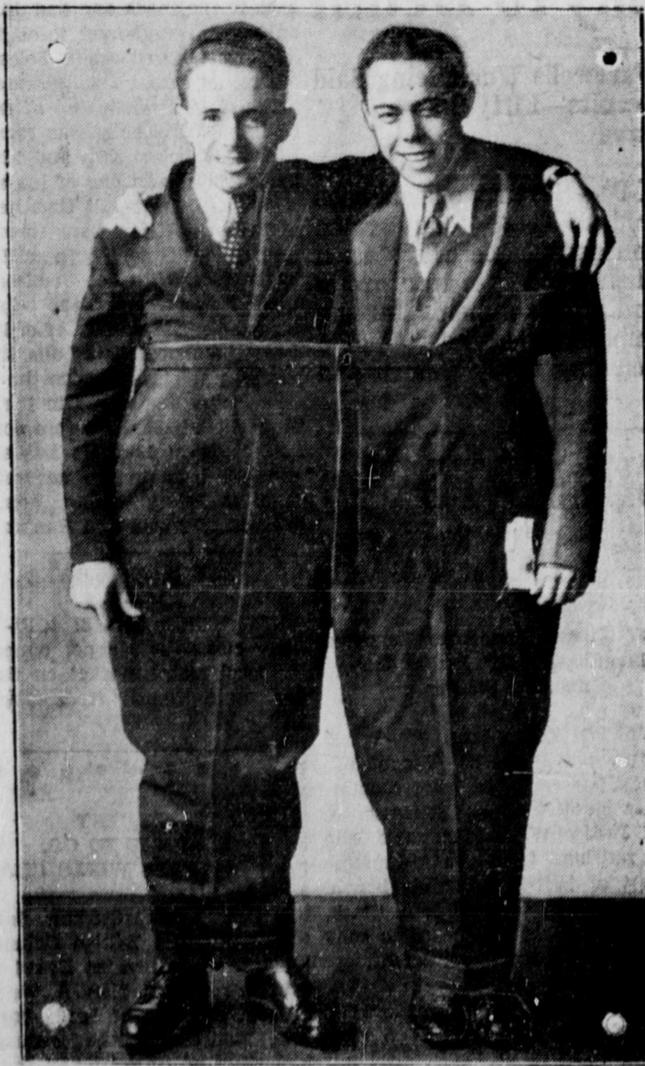
A customer walked into a Sackatoon store which advertised "No charge for oversize," and ordered these trousers. They measure 39 inches about the waist.