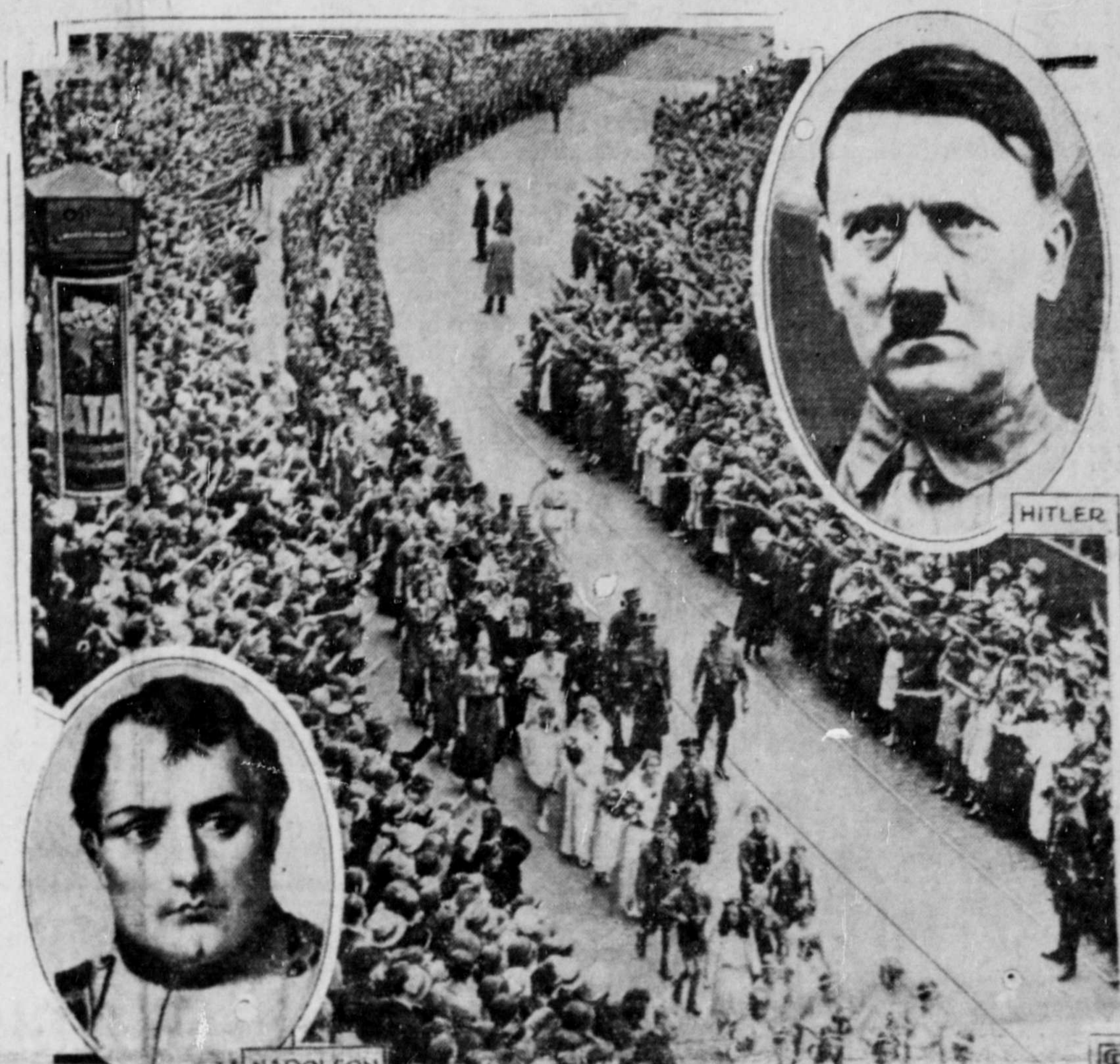
Mass marriages have become the order of the day in Germany under the rule of Adolf Hitler. Picture shows 30 Hitlerites and their brides-to-be marching to a ceremony in Berlin. But the Nazi dictator still has to go some to equal the weddings en masse during the time of Napoleon Bonaparte, emperor of another day. When Napoleon Marie Louise he promised dowries to 6,000 girls of "irreproachable character" who would wed 6,000 of his soldiers. On April 29, 1910, the marriages were celebrated simultaneously before the eyes of Napoleon's officials, and the dowries were paid.