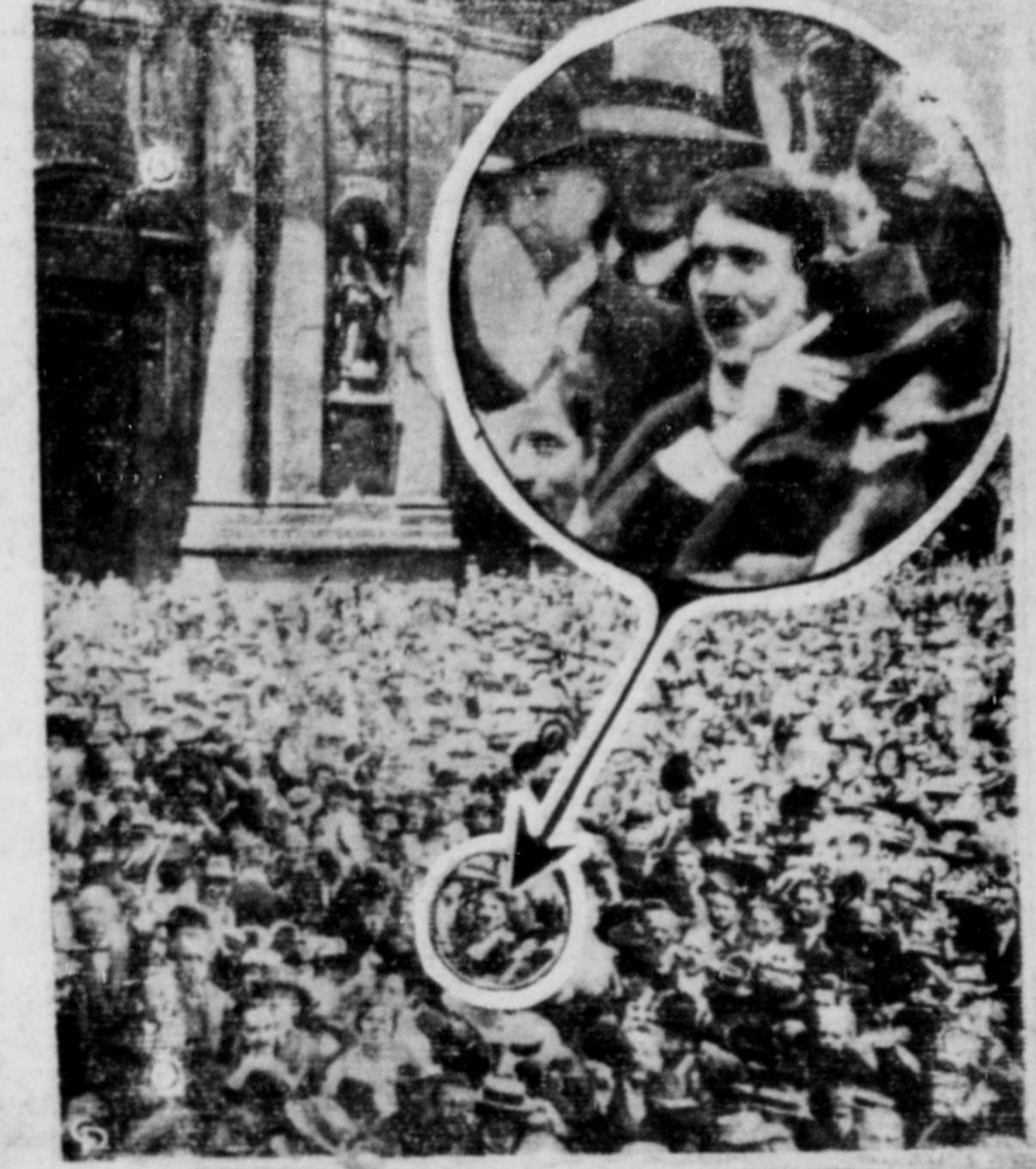
Twenty years makes a vast difference as this picture proves. Made August 2, 1914, it shows Adolph Hitler (as in enlargement) in the crowd that jammed the square in Munich, cheering news that Germany had declared war on Russia. Twenty years later, to the day, Adolph Hitler became undisputed dictator of Germany.