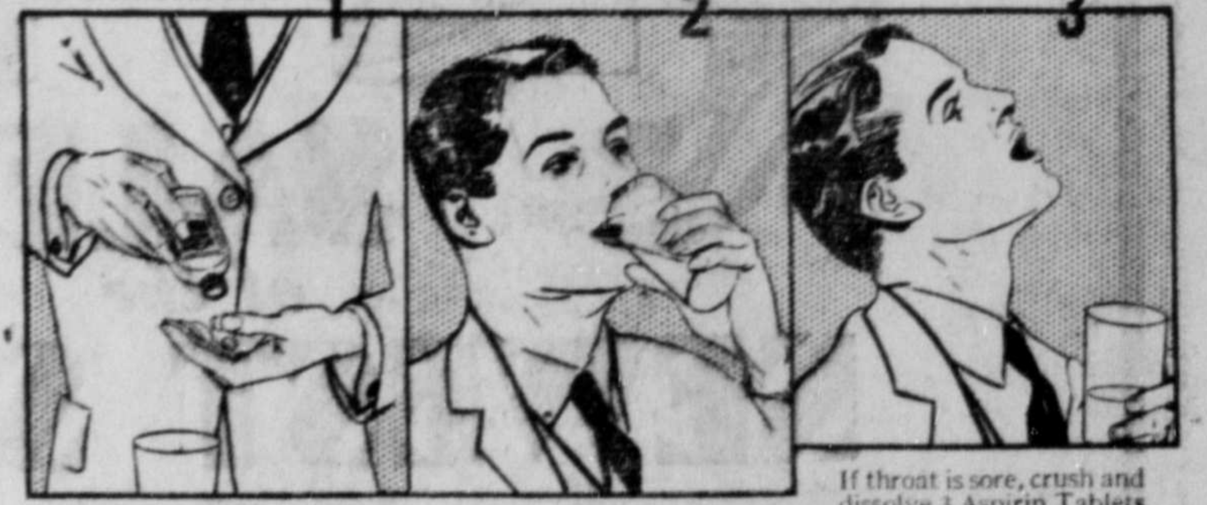
Take 2 Aspirin Tablets. Drink full glass of water. Repeat treatment in 2 hours.