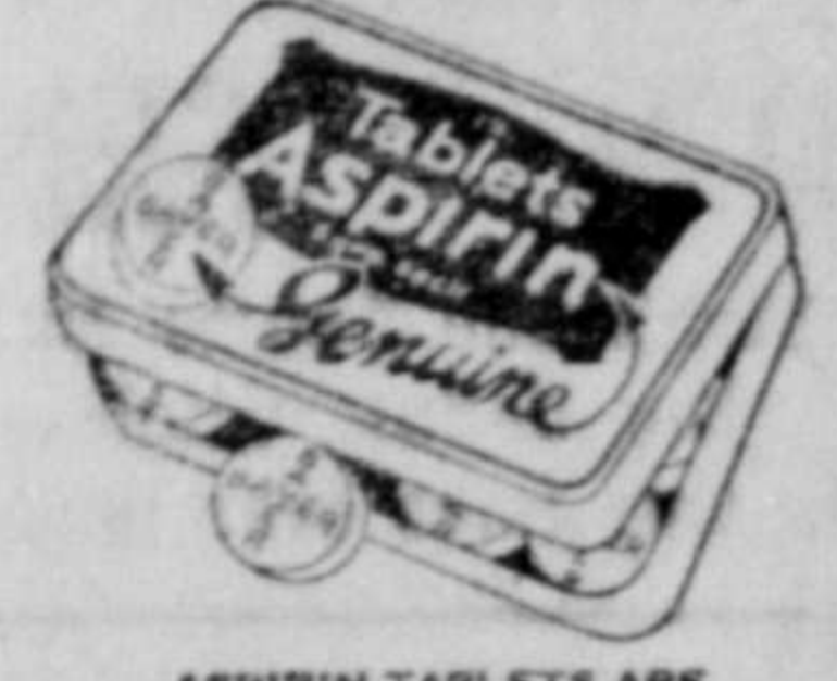
ASPIRIN TABLETS ARE MADE IN CANADA

Ask your doctor about this. And when you buy, see that you get Aspirin Tablets, Aspirin is the trademark of The Bayer Company, Limited, and the name Bayer is the form of a cross, is on each tablet. They dissolve almost