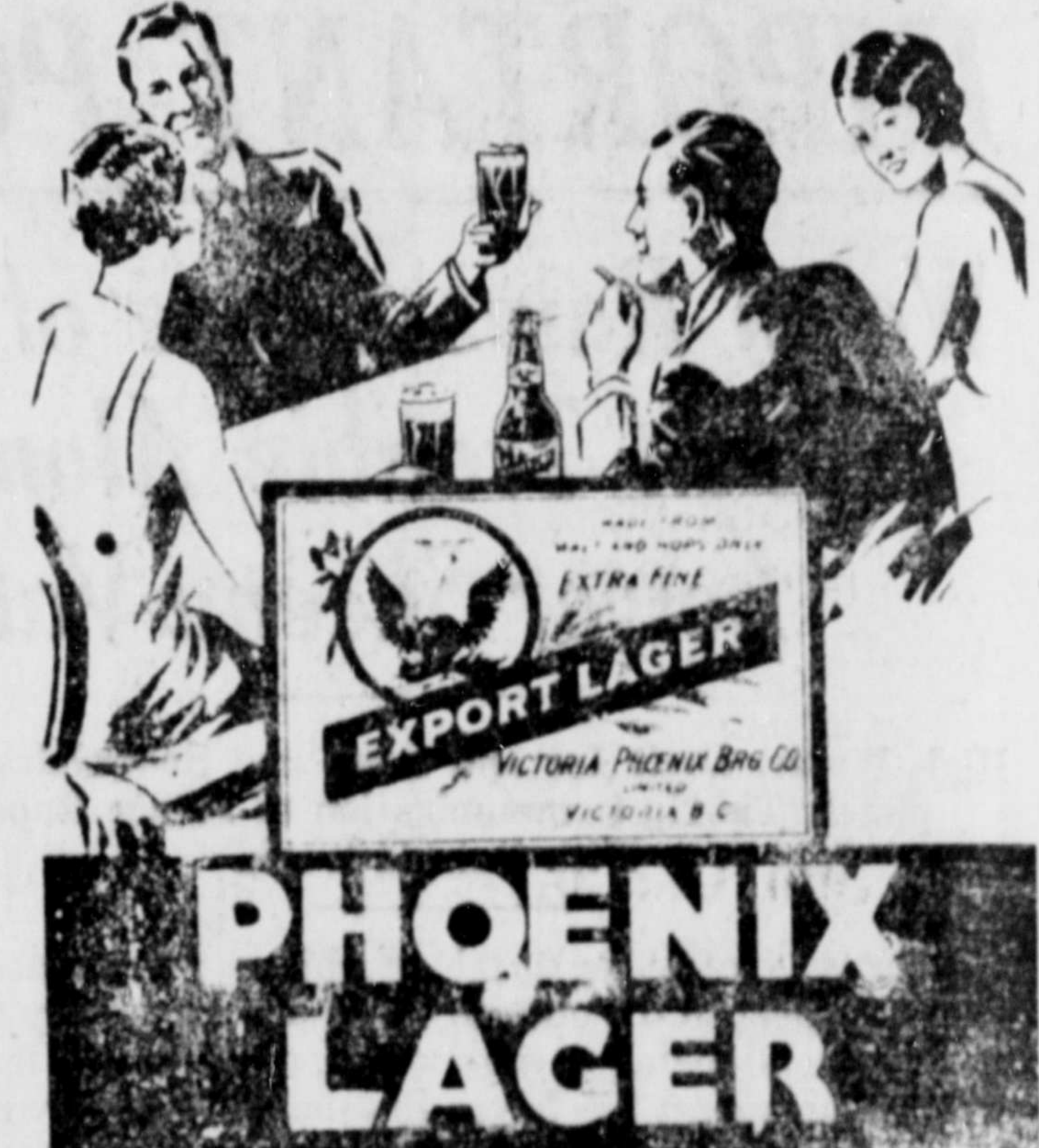
This advertisement is not published or displayed by the Liquor Control Board or the Government of British Columbia.

After a couple of hours of "Auction" or "Contract" . . . complete an enjoyable evening with a light repast of sandwiches, crackers, cheese and PHOENIX LAGER. PHOENIX LAGER is sparkling, pure and healthful. It is so easy to serve, and many prefer it as a late evening beverage because it aids digestion and induces calm repose.