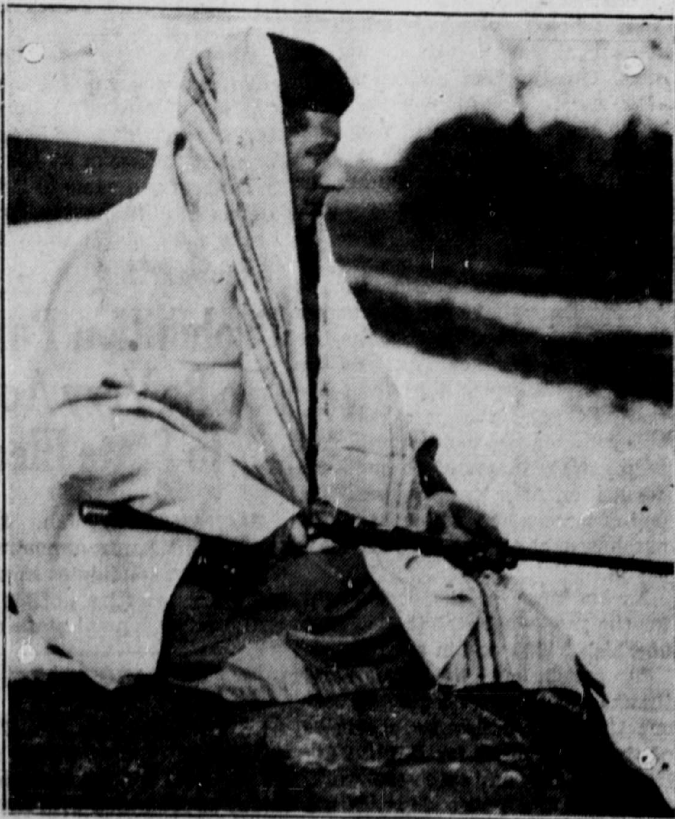
The newly-formed Athlon Angling club over in the old country held their first rally at Walthamstow Reservoirs, fishing for pike recently. One of the members of the club, who did not intend to catch cold, well wrapped up in a blanket.