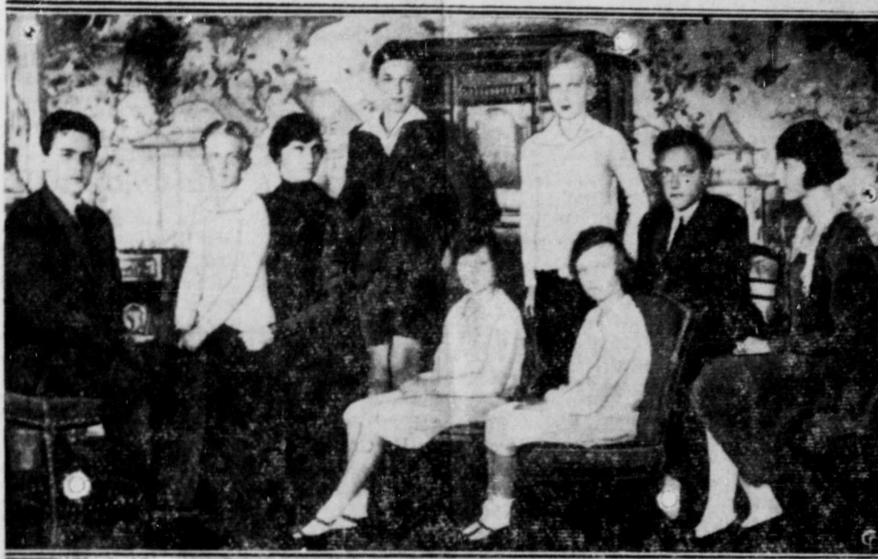
An exiled royal family, the former Empress Zita and her eight children, were pictured at Steenockerzeel castle. The royal hopes of this family are vested in the 21-year old Archduke Otto, extreme left, who is being groomed as claimant for the throne vacated by his father, the late Emperor Karl, according to observers of monarchist activities in Austria. The monarchists are said to be planning a coup in his favor. Archduke Otto has just left Steenockerzeel presumably for Italy where it is reported he will press suit for the hand of Princess Maria, youngest daughter of King Victor Emmanuel.