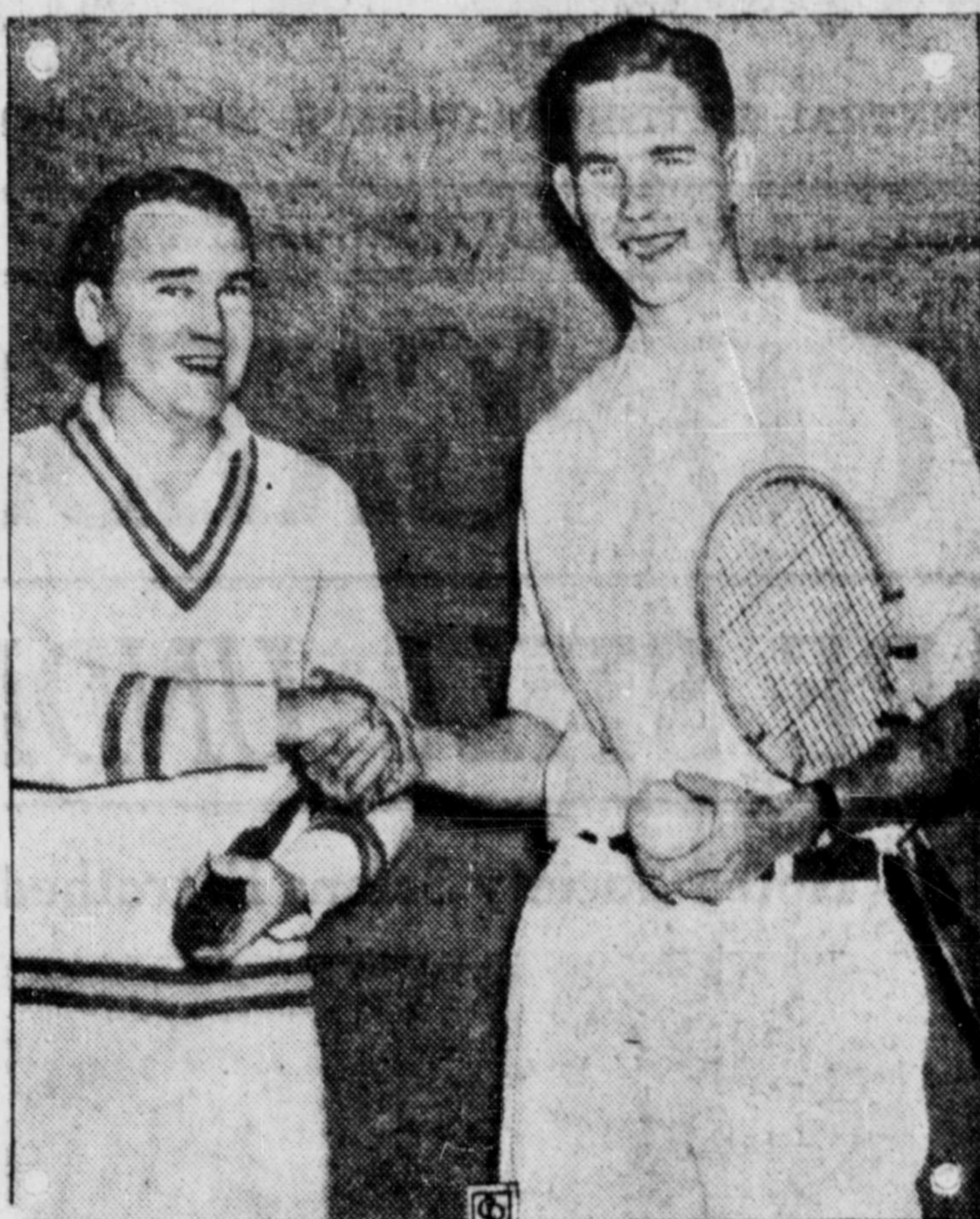
VINCENT RICHARDS ELLSWORTH VINES

Ellsworth Vines, former national champion, who has turned tennis professional, returns to New York from his Pacific-coast home to train for a pro tour and is welcomed to the ranks of "money" players by Vincent Richards, professional champion. Vines will tour in company with Big Bill Tilden, Henri Cochet, Karel Kozeluh and other pro stars.