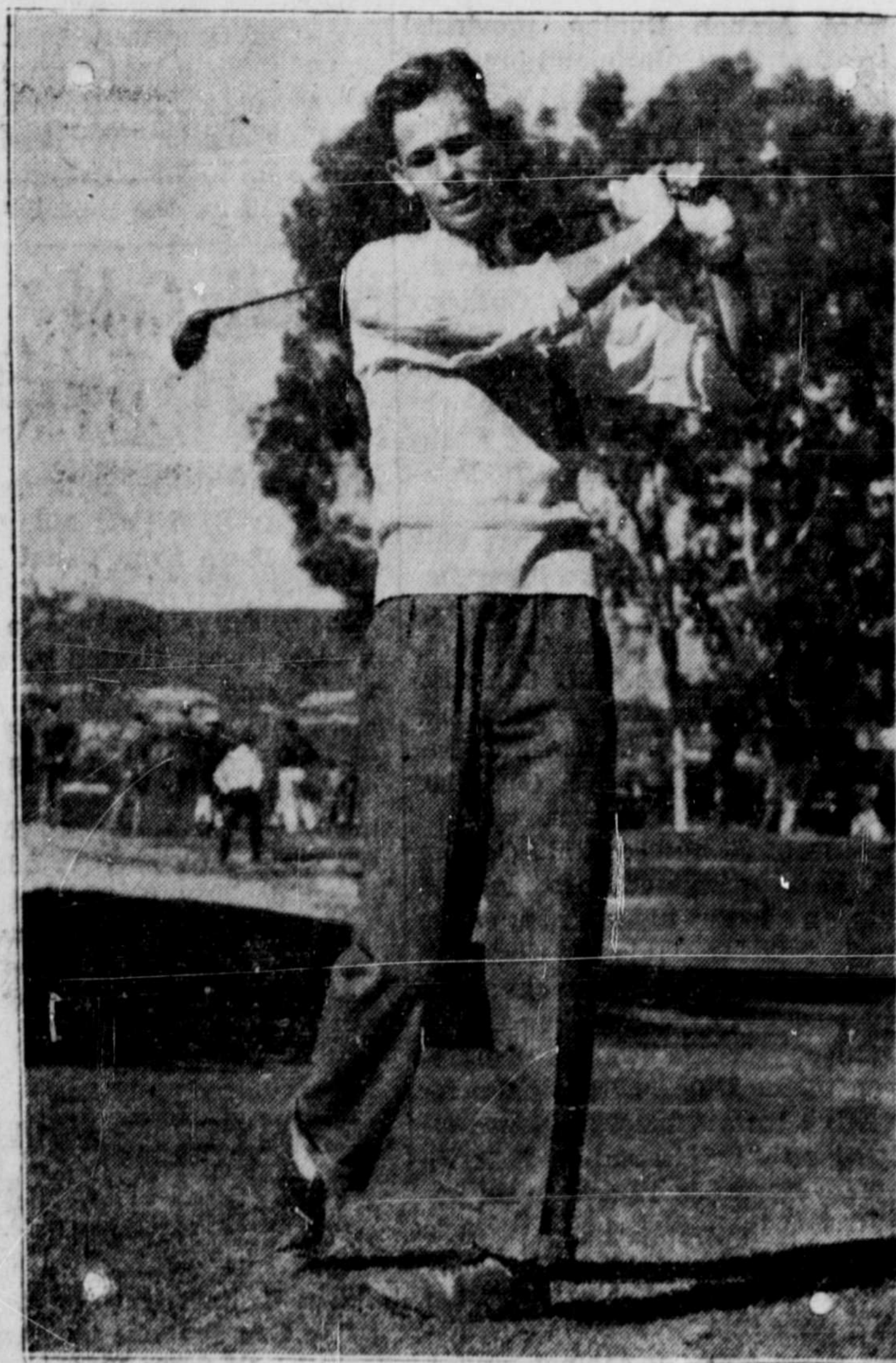
A pro in tennis—an amateur in golf. Ellsworth Vines, former U.S. national tennis champion, who recently turned pro, is entered in the Pasadena open golf tournament at Pasadena, Cal., as an amateur. However, a golf professional could not enter an amateur tennis tournament, thereby bringing up the old question, "What is an amateur?" This picture shows him driving off at Pasadena.