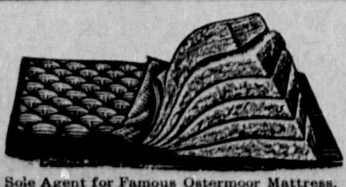
Sole Agent for Famous Ostermoor Mattress.

We carry a full line of Carpet, Linoleums, Crockery, Couches, Glassware, Table Cutlery, Baby Carriages, etc., etc., etc.