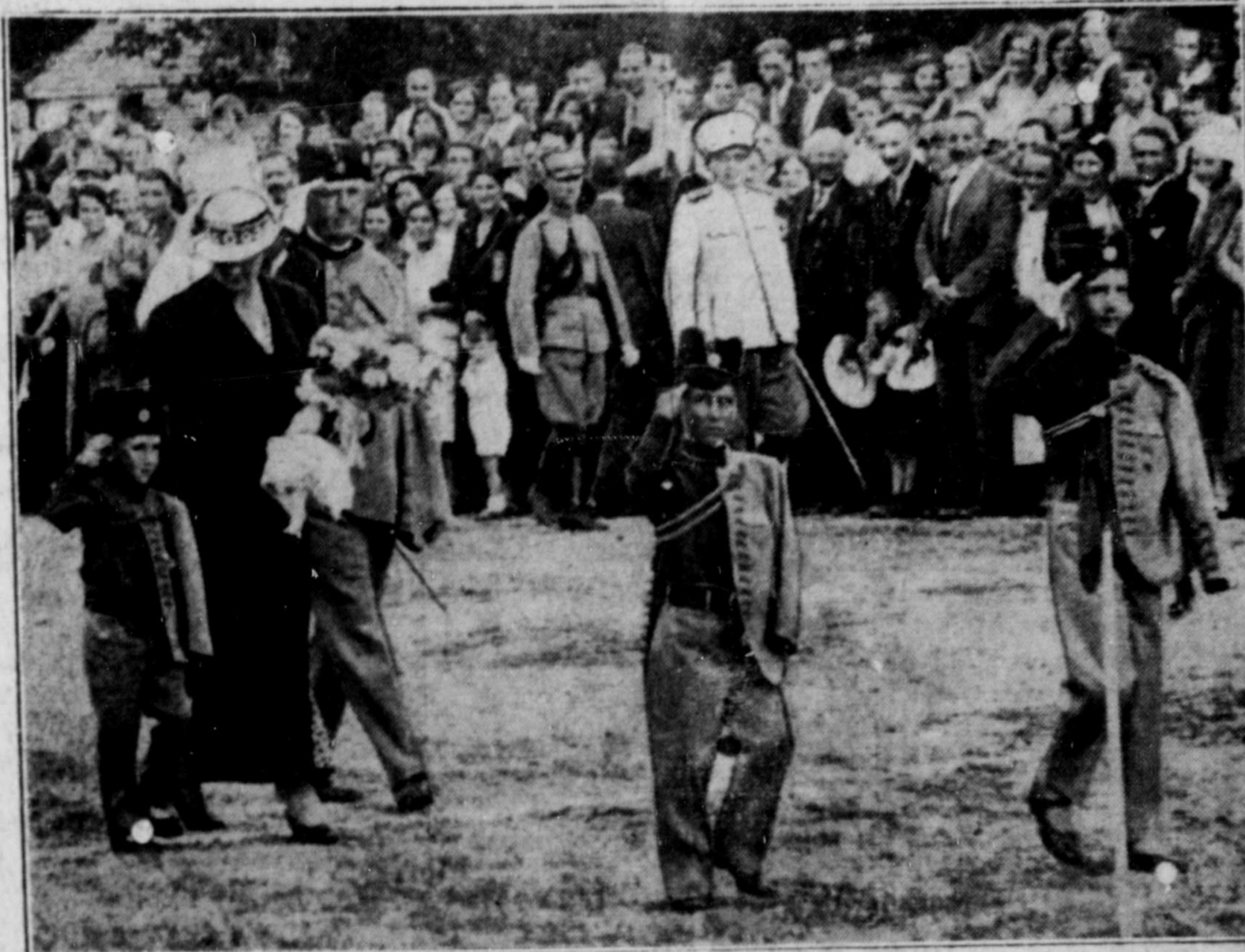
King Peter II., of Yugoslavia who succeeds his slain father, is seen above at the right with his brothers, Prince Tomislav and Prince Andriya, during a vacation at Hercegnovi, Yugoslavia.