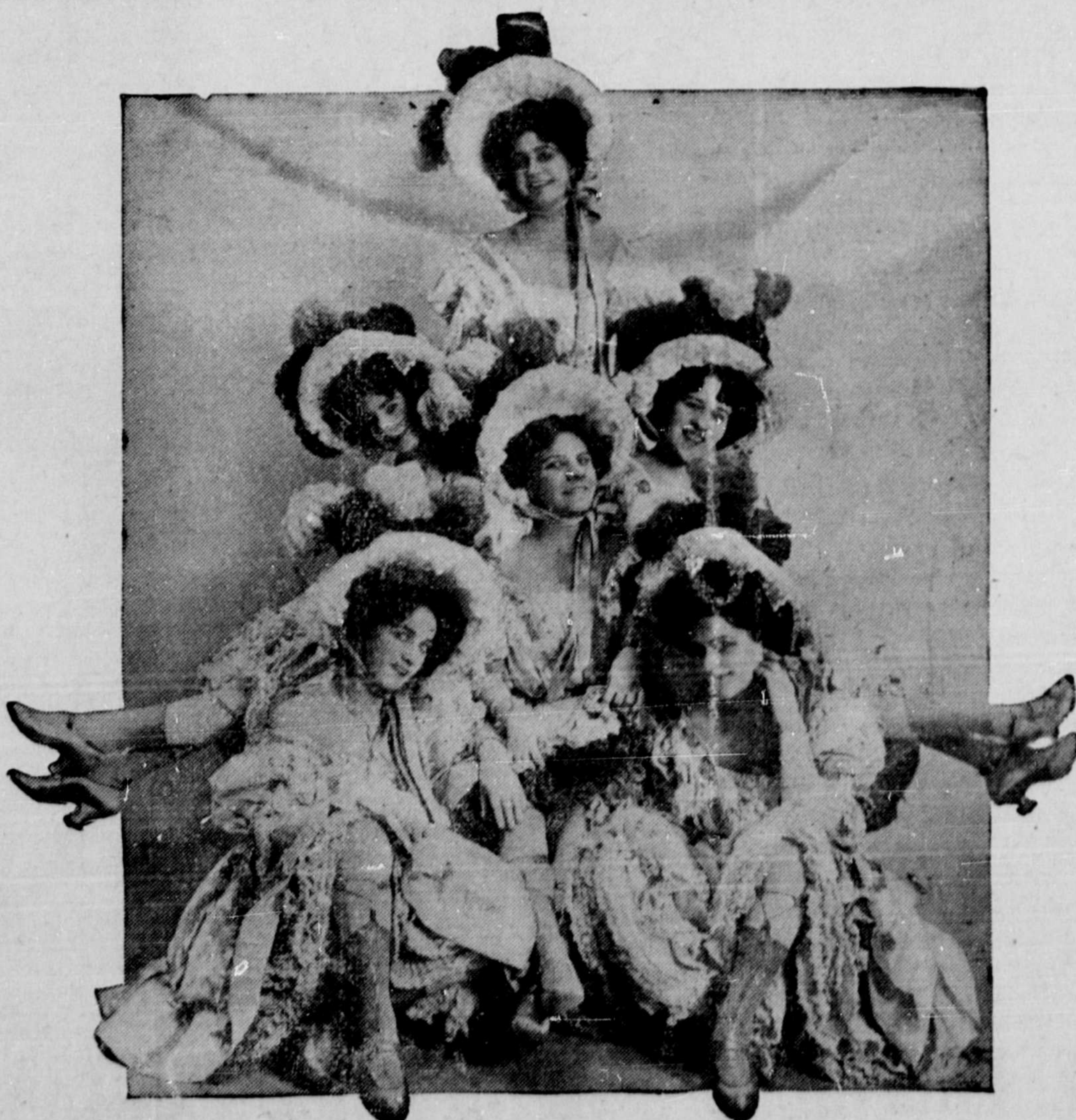
Some of the chorus with The Minister's Son, at the Empress Theatre, tonight.

1142 Pender Street West - Vancouver, B.C. Phone 8500.