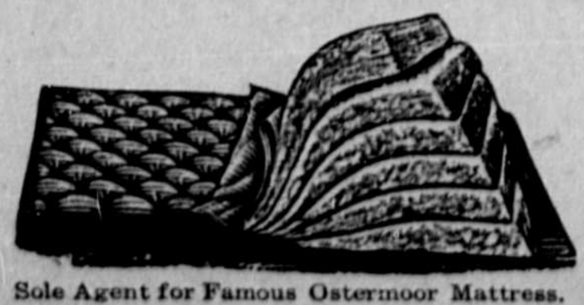
Sole Agent for Famous Ostermoor Mattress.

We carry a full line of Carpet, Linoleums, Crockery, Couches, Glassware, Table Cutlery, Baby Carriages, etc., etc., etc.