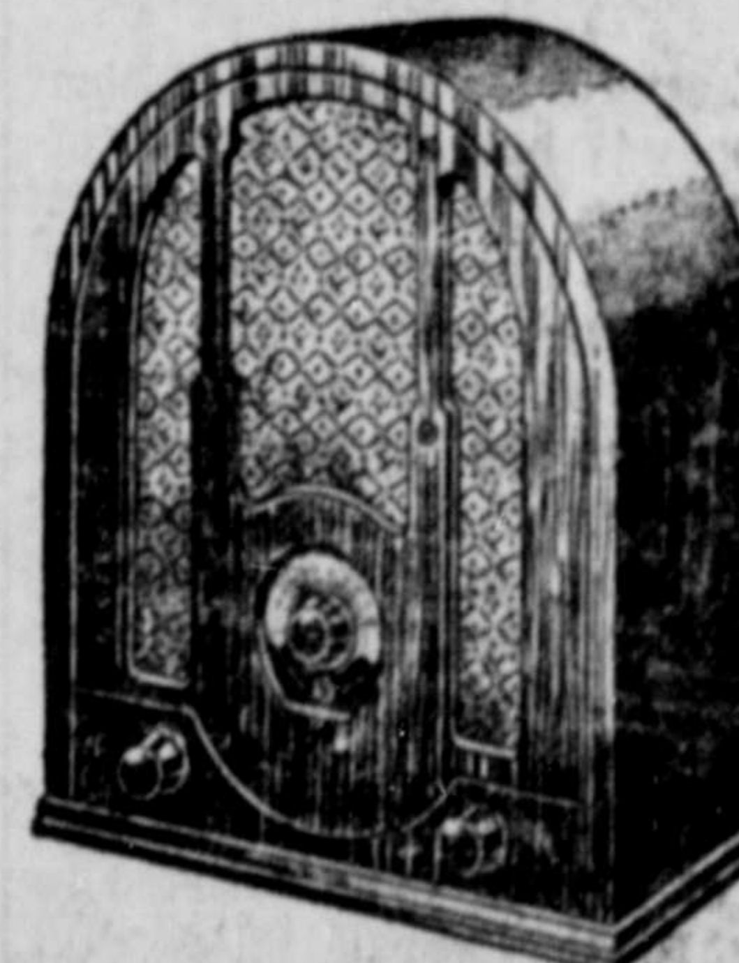
Model M-42 $39.95 Other Models at Attractive Low Prices

... there is one at just the price you want to pay