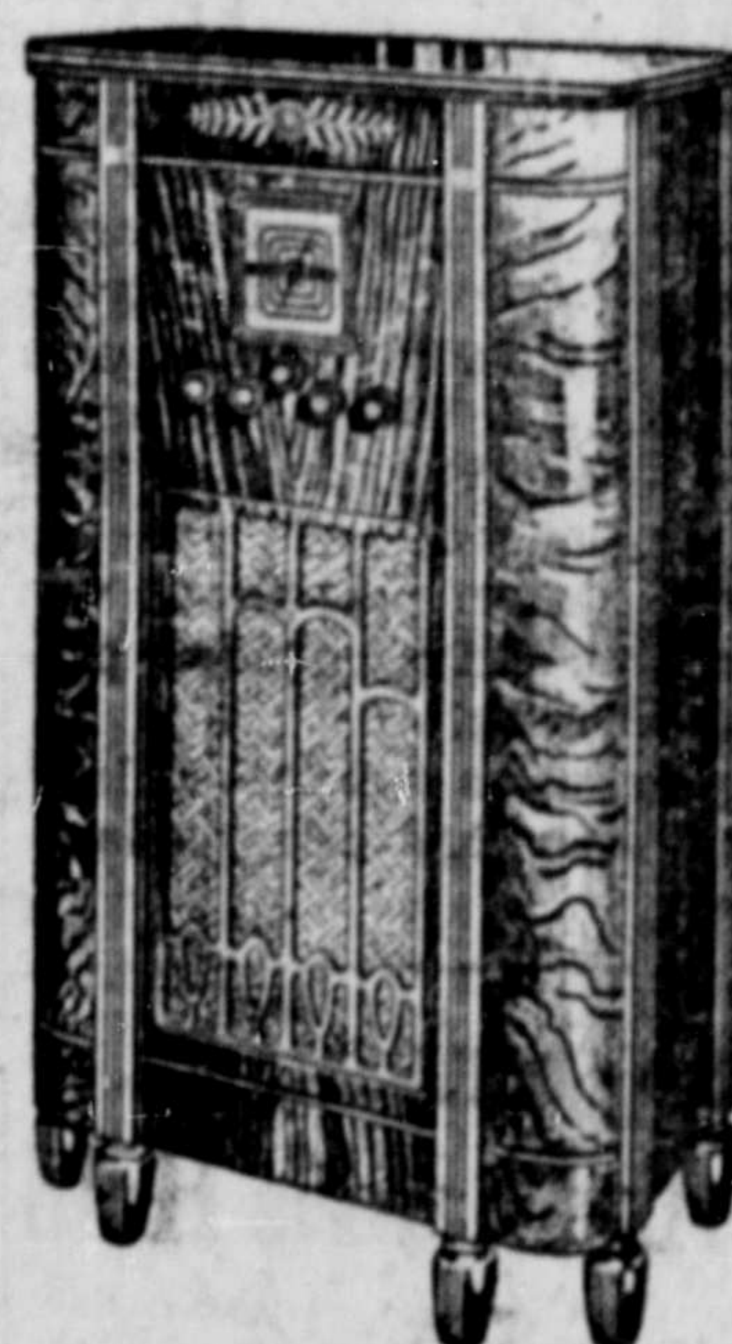
Model M-65 $114.50