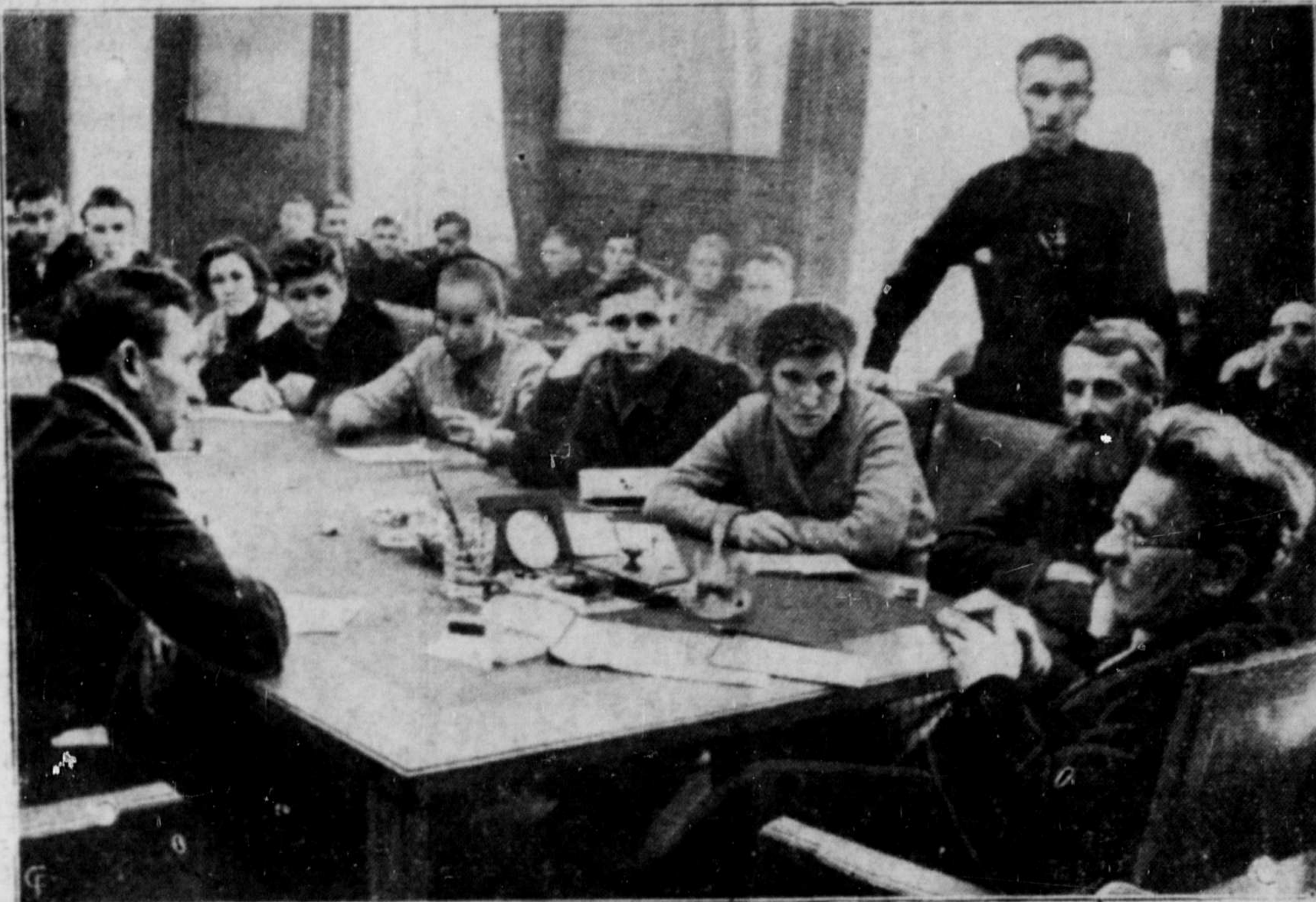
Photo shows President Kalinin, RIGHT foreground, talking with the group of collective farm brigadiere, or leaders of the collective farm work, during their recent conference in Moscow on means of increasing the harvest by application of the latest scientific discoveries in the conference room in the Kremlin that with proper management the crop yield of their collective grain fields should reach 16 hundredweights per 2.2 acres.