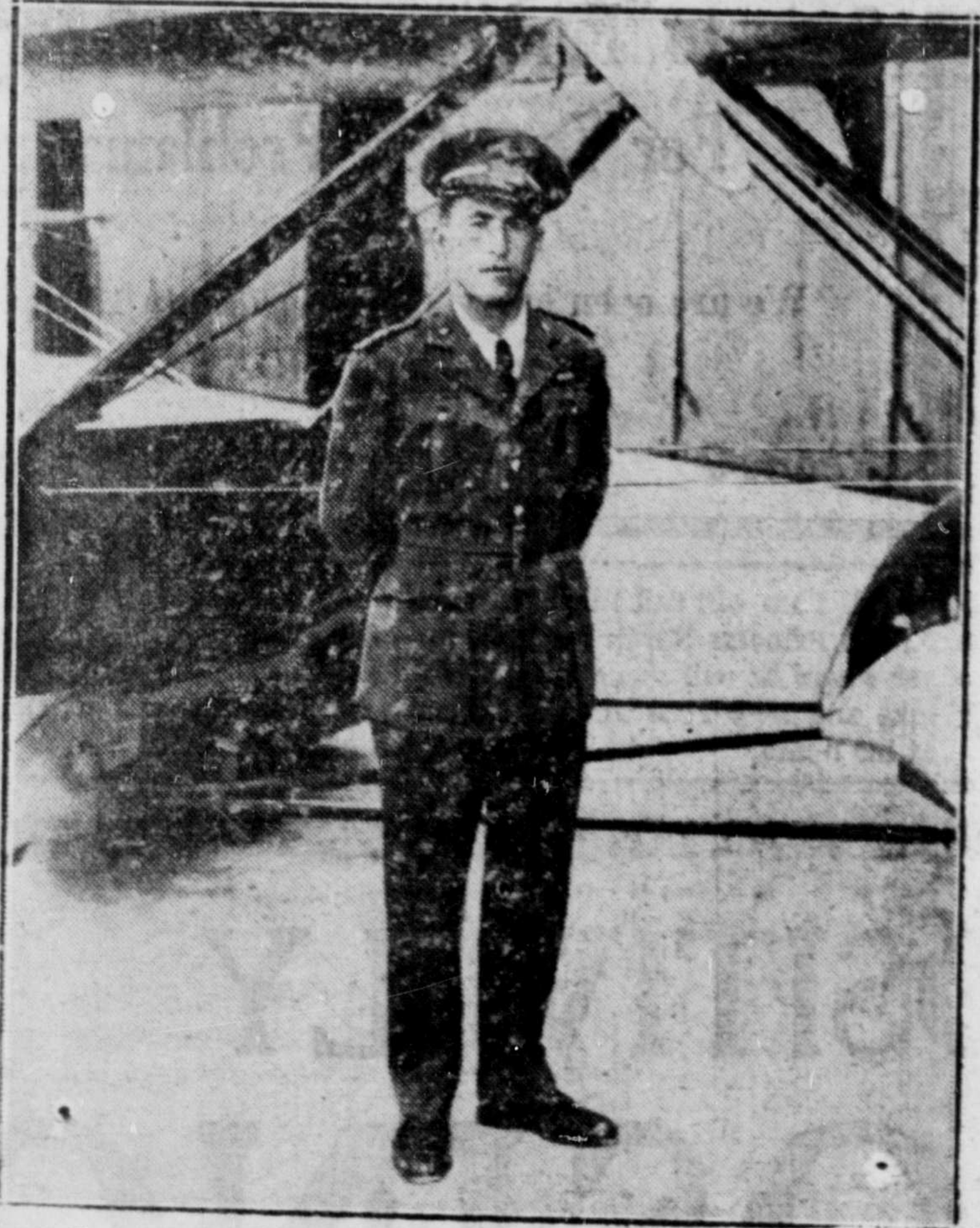
Lieut. Francesco Agello, called the "crazy boy" of Italian aviation, stepped into his seaplane the other day and set up a new speed record of 435 miles an hour, breaking his former record of 423 miles per hour.