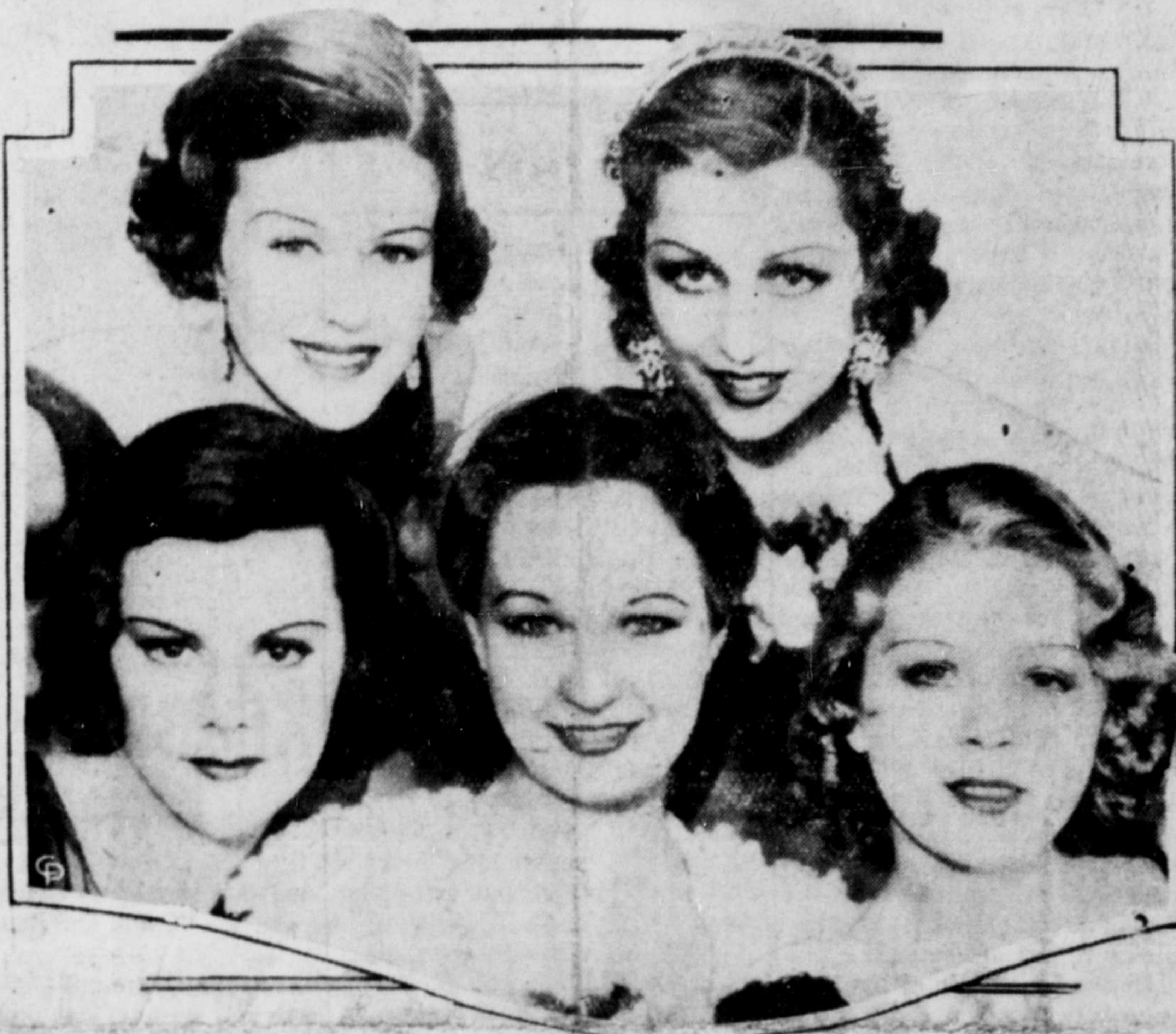
The Wampas has refused to pick any studio contract players on its 1934 Baby Star selection, so Paramount's executives, stars, writers and directors voted on their own. Here are five of Paramount's proteges—Top Row, left to right: Elizabeth Young and Frances Drake; bottom row, left to right: Helen Mack, Evelyn Venable and Dorothy Dell. The sixth, Ida Lupino, is in Vancouver on a vacation. Paramount believes these six will be stars, and they will be so groomed with good roles