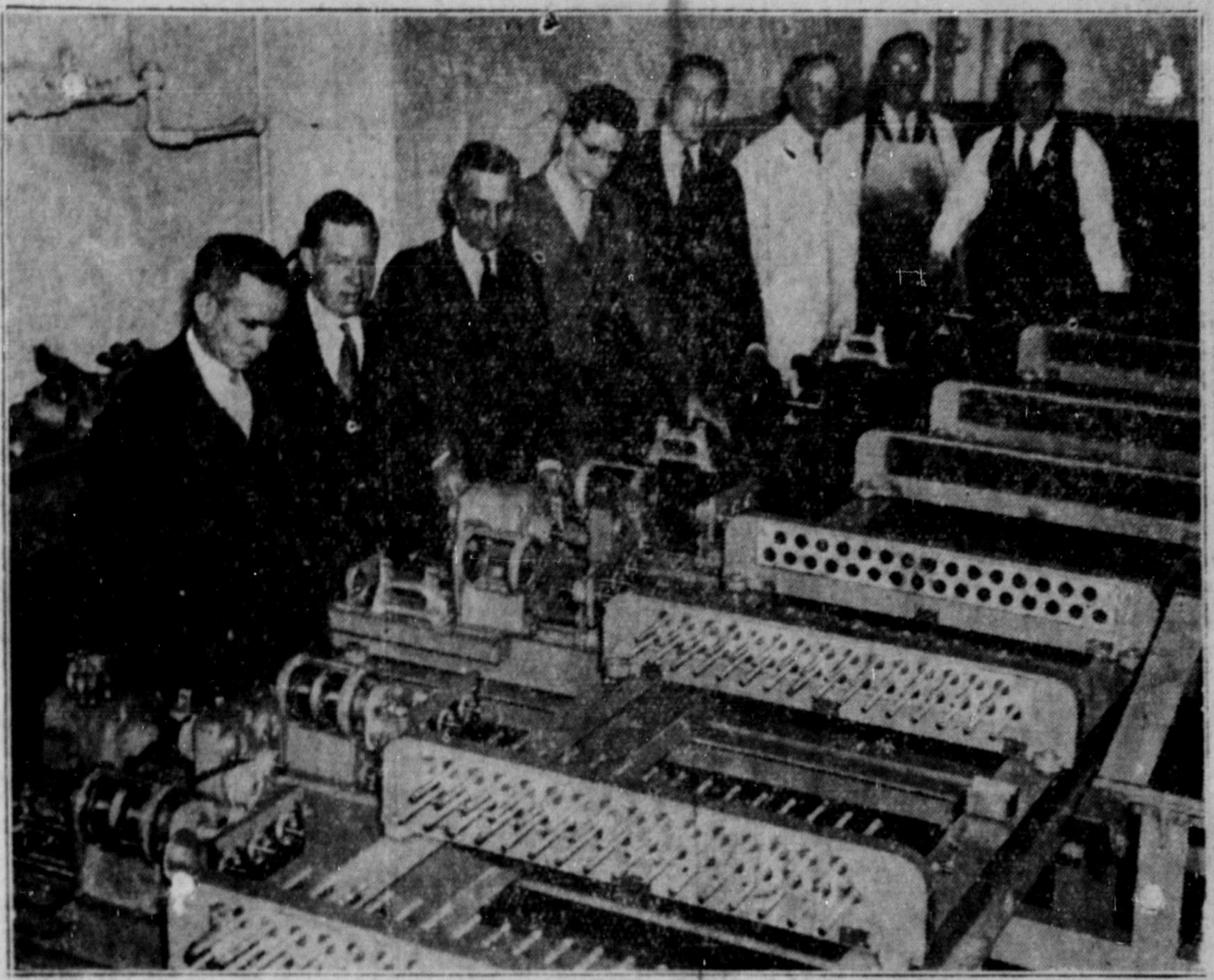
A group of civil works administration workers engaged in the construction of the differential analyzer, at the University of Pennsylvania, which will solve, in 15 minutes, mathematical problems that would take five experts four months to do.