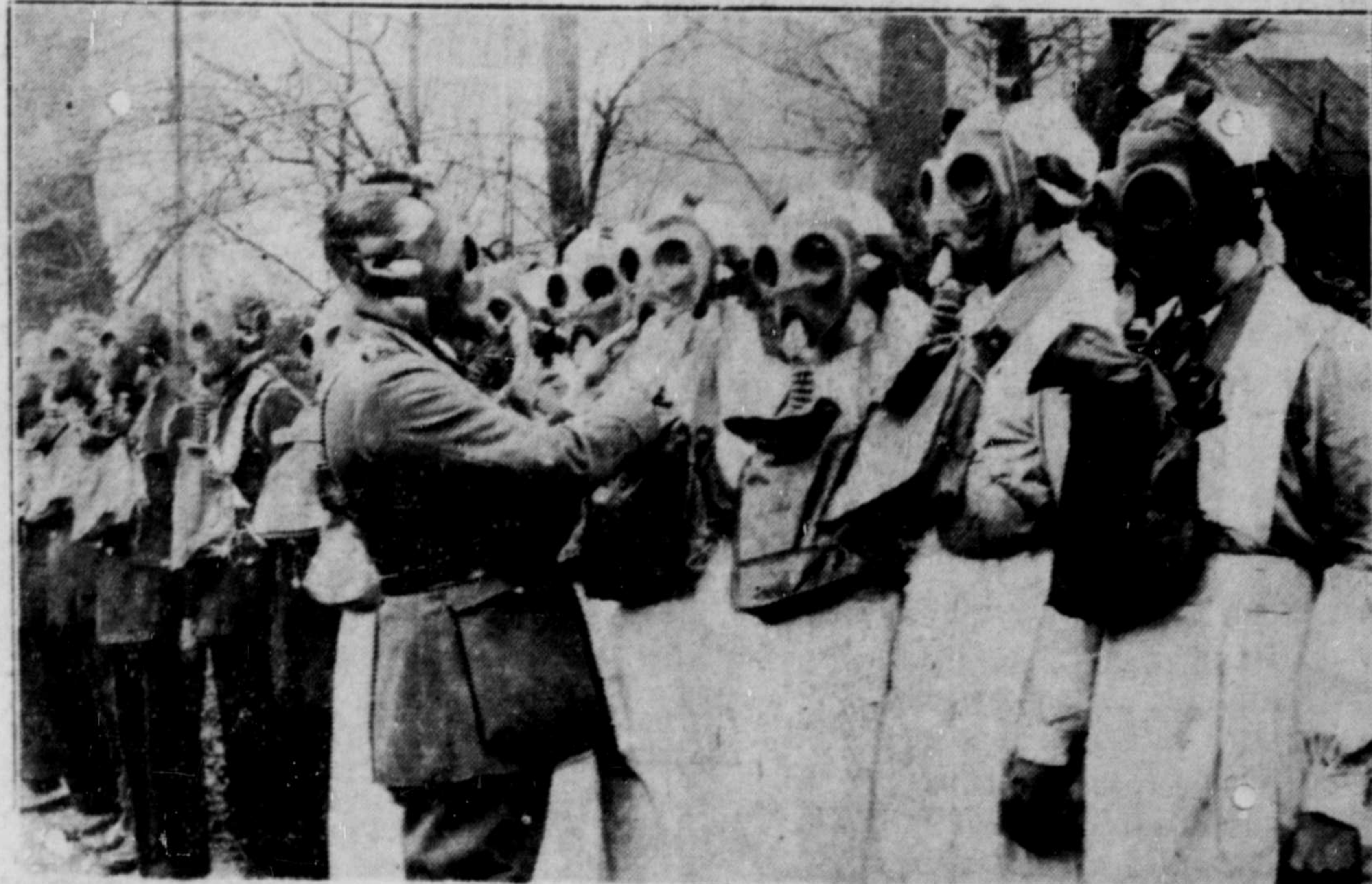
Peace talk is swell, say these Red Cross nurses, but just show us how gas masks work—just in case. And so, at Camberwell barracks England, this officer lets everybody in on the gas-mask racket. So there'll be no complaints if things don't turn out so good later on.