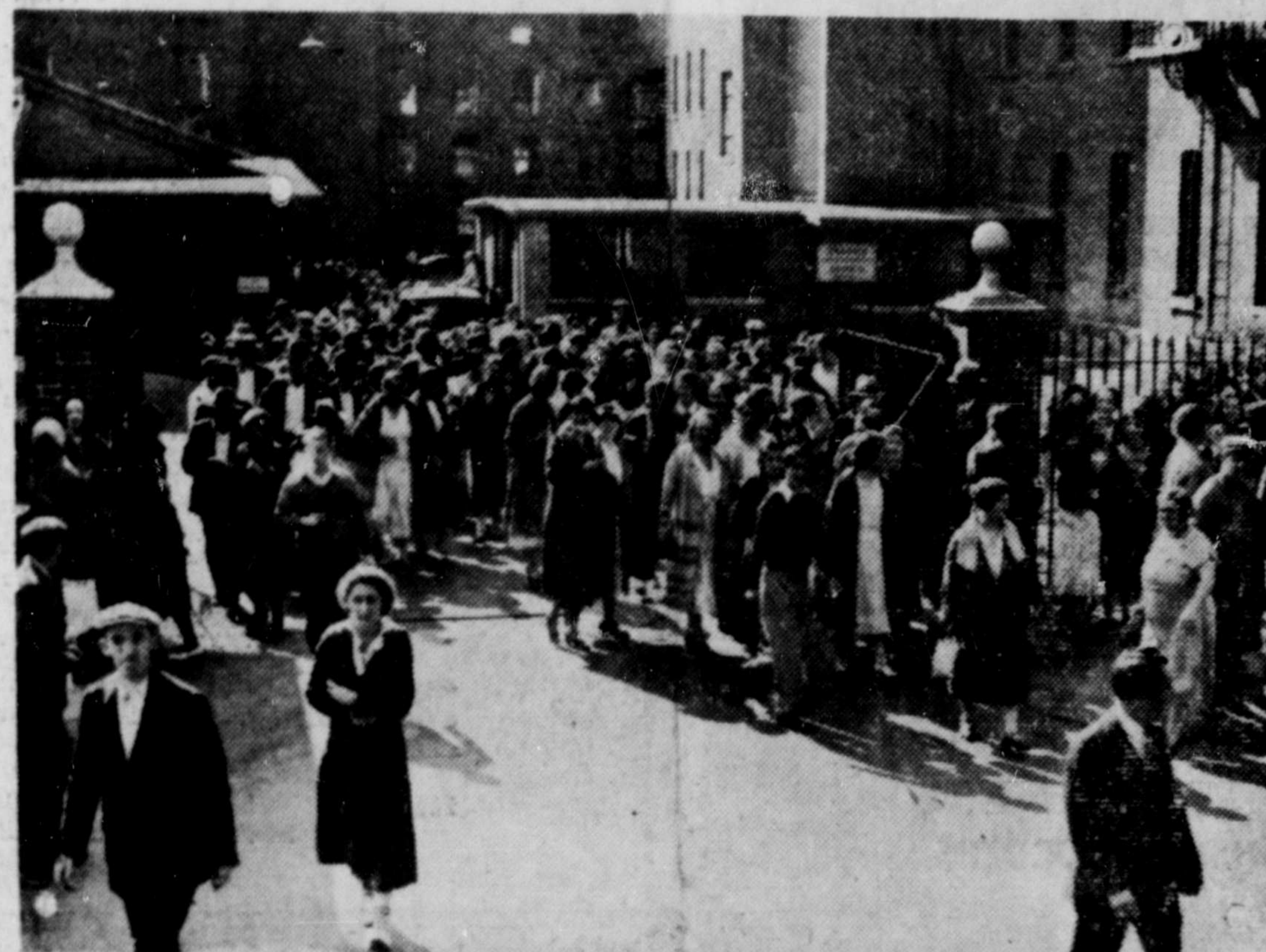
Here is the latest photo showing the beginning of the nation-wide textile strike in the United States as hundreds of thousands of workers left their machines in pursuance to union walkout order. This shows employees of a Rhode Island mill marching out after the strike "zero hour." The strike is continuing with the critical centre moving from the Carolinas to New England. An attempt was to be made today to re-open some of the textile mills in Virginia and the Carolinas under protection of National Guards. Meantime, President Franklin D. Roosevelt, in a yacht off Rhode Island, has been closely in touch with the situation.