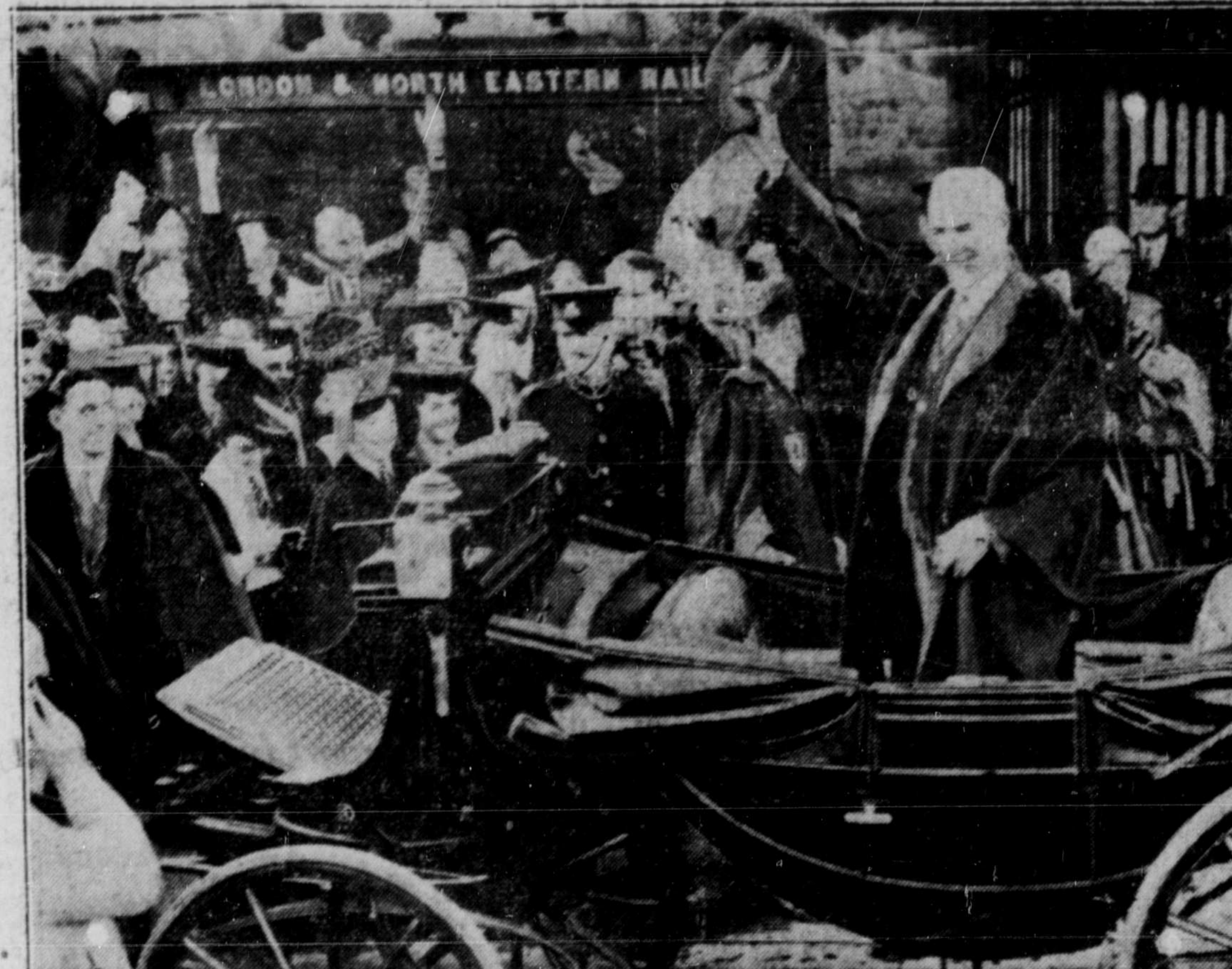
General Jan Christian Smuts, who represented South Africa at the last peace conference, is cheered by students as he arrives to take over his duties as rector of St. Andrew's college, Scotland.

"... So that Our Visitors will be Sorry to Leave"