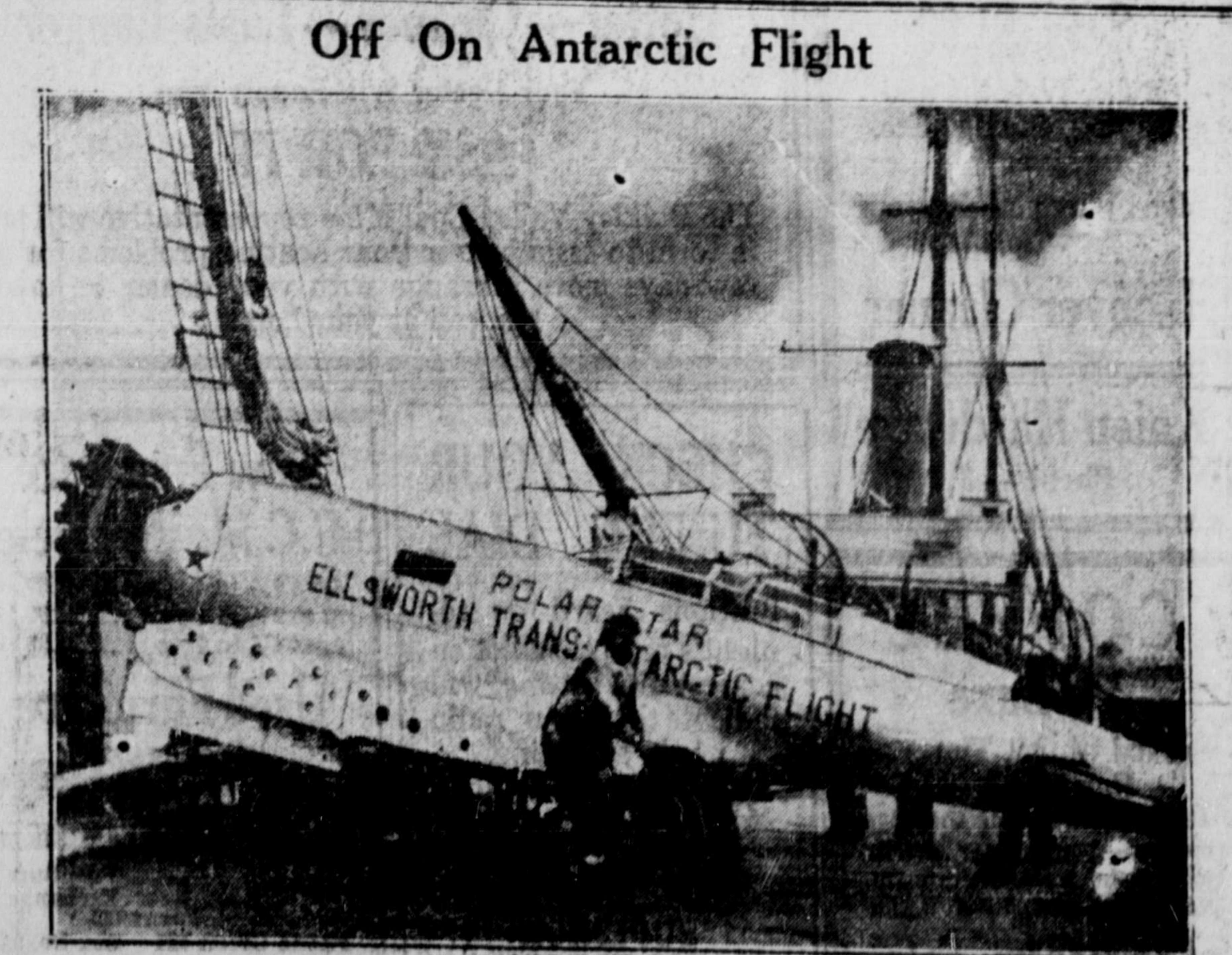
The Polar Star, to be used in Lincoln Ellsworth's Antarctic flight, going aboard ship at Dunedin, New Zealand, bound for the jumping off base on Deception Island. Bernt Balchen is seen with one of the wheels.