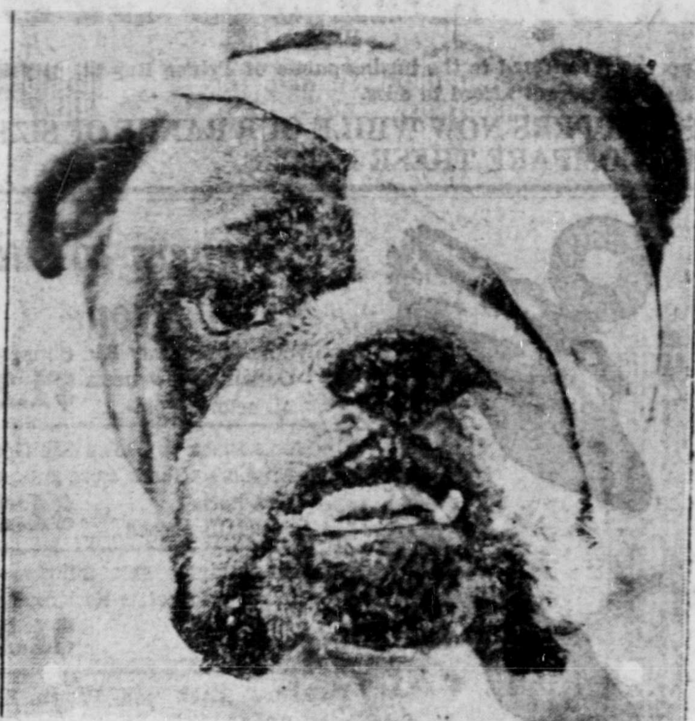
He fought and won on London streets and no doubt feels thoroughly happy about his victory over the cat who dared to stand against him, even though he did get a black eye.