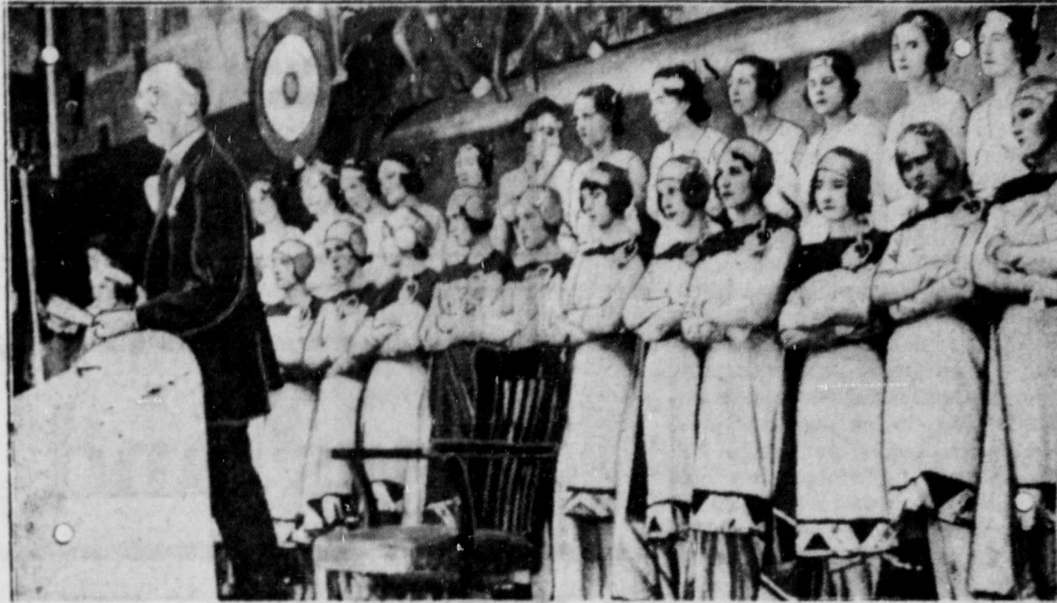
And this, ladies and gentlemen, is where many of you left some of your money. The above picture shows the scene at the drawing of the Irish Sweepstakes which was followed by millions all over the world and which gave major prizes to several Canadians.