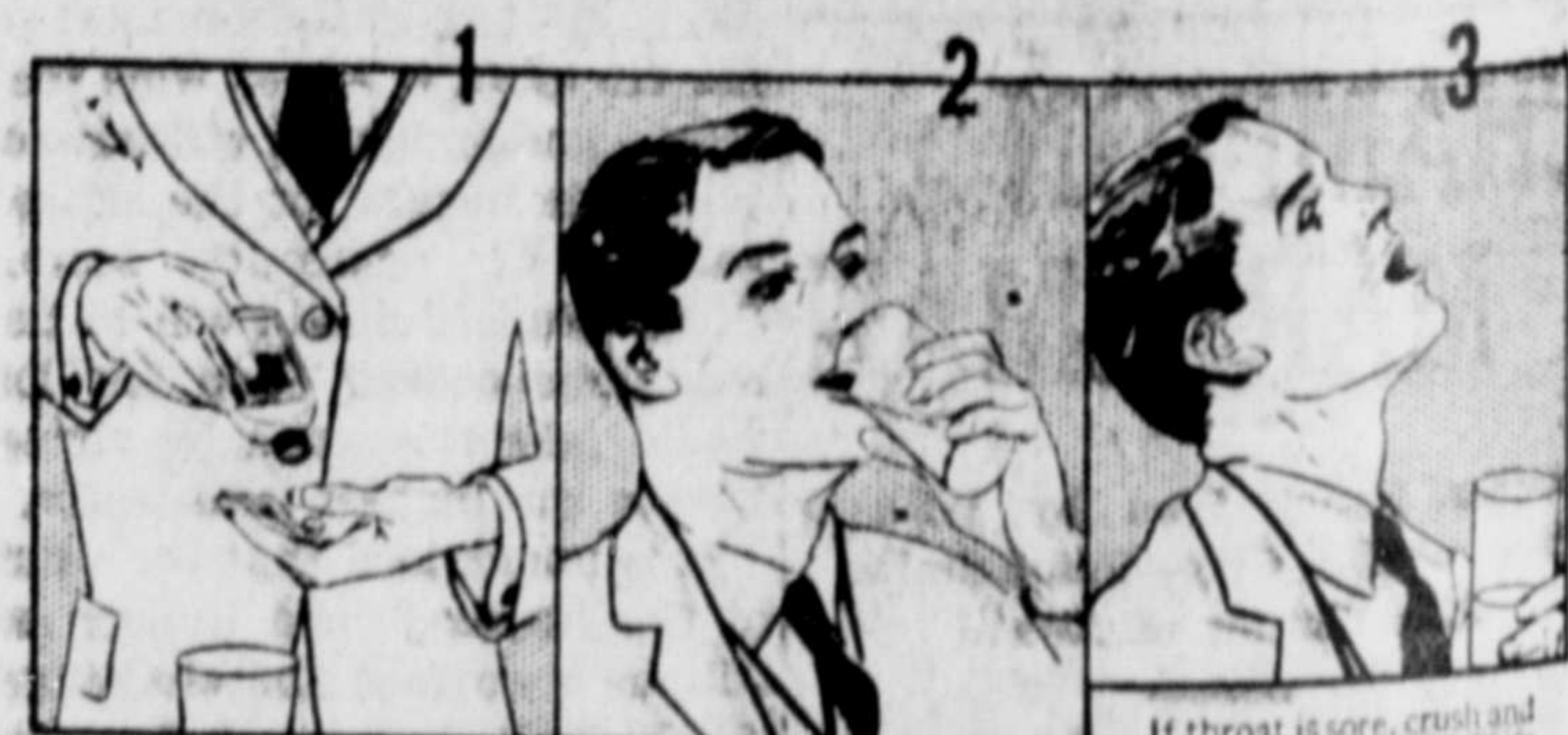
Take 2 Aspirin Tablets. Drink full glass of water. Repeat treatment in 2 hours.